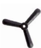
BA7311 11" Tripod Utility Base. 5 lbs.