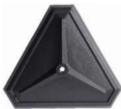
BA1516 15" Hex-Base. 16 lbs.