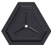
BA1313 13.5" x 12" x 1.25" Stamped Hex-Base. 13.25 lbs.