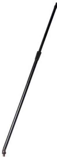
MSS8412 41-69" Shaft with 15° tilting lower shaft. 7/8" and 1-1/8" Steel Tubing