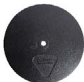
BA1006 10" Round Base. 6 lbs.