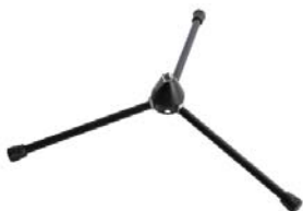
BA9750 24" Tripod Base with folding legs.