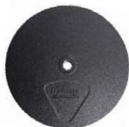
BA1210 12" Round Base. 10 lbs.