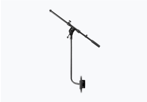
CLAMP-ON MIC BOOM ARM MSA8020