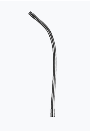
MSA9030-19C / Chrome