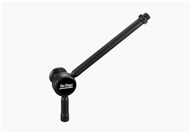
7" POSI-LOCK MINI BOOM MSA-9502