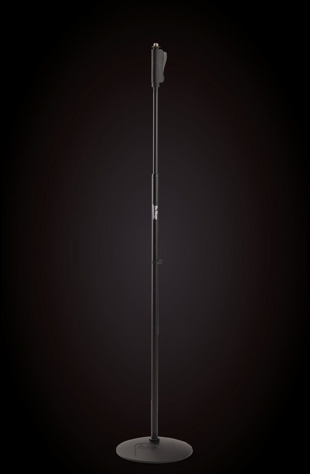
NEW PRODUCT ONE-HANDED MIC STAND WITH ROUND BASE MS9510