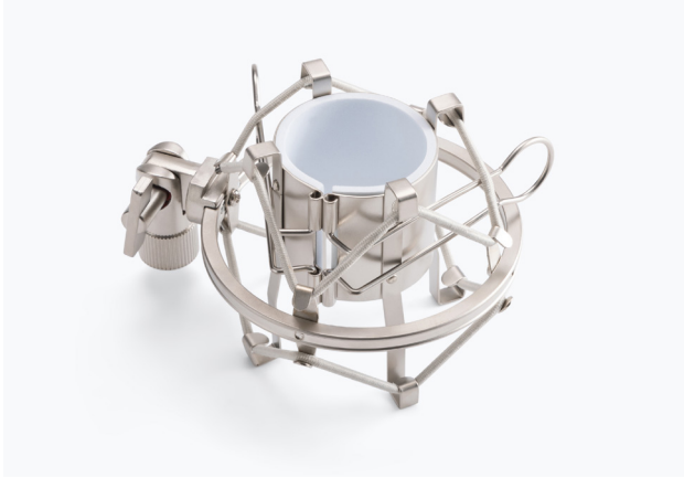
SHOCK MOUNT FOR STUDIO MICS MY410CG / Champagne