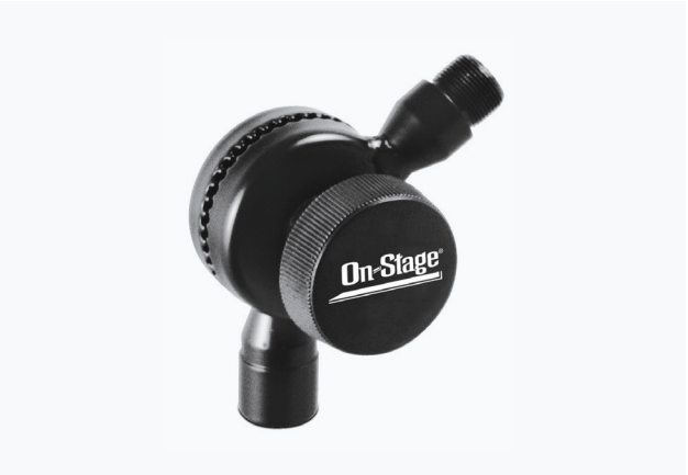
POSI-LOCK CLUTCH MSA-9501