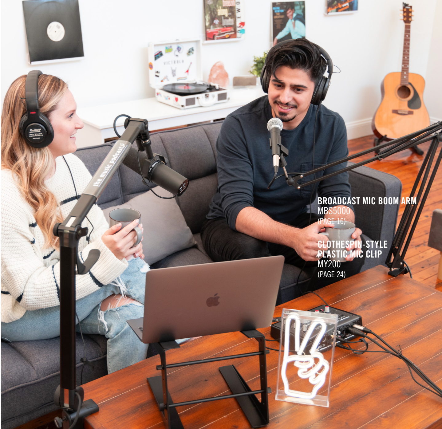
BROADCAST MIC BOOM ARM MBS5000 (PAGE 16)