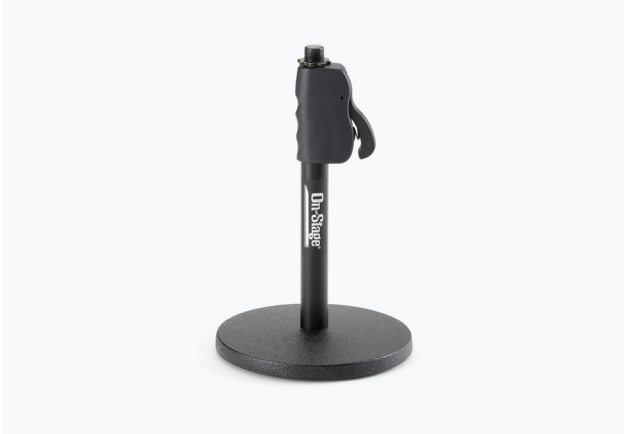
QUICK-RELEASE DESKTOP MIC STAND DS7200QRB