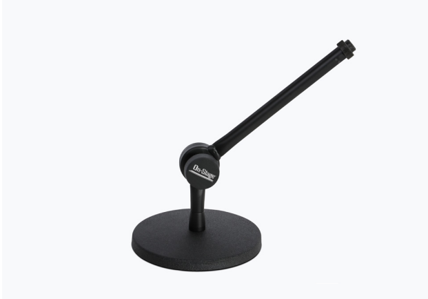
POSI-LOCK DESKTOP MIC STAND DS300B