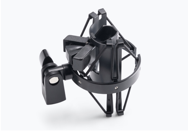
SHOCK MOUNT FOR STUDIO MICS MY420