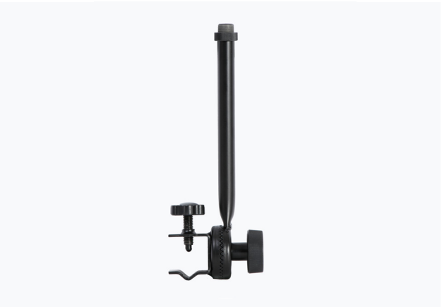
POSI-LOCK SIDE MOUNT MINI BOOM MSA-9508