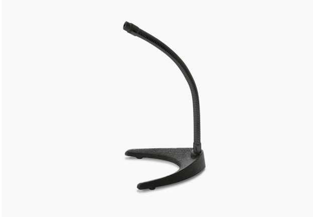
GOOSENECK DESKTOP MIC STAND DS6213