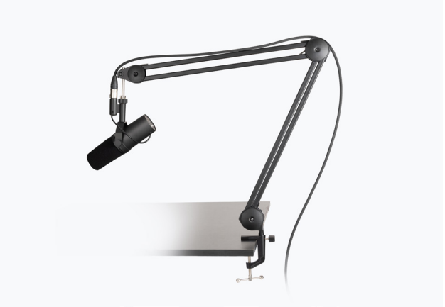
PROFESSIONAL STUDIO MIC BOOM ARM MBS7500