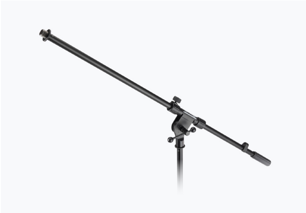
MIC BOOM MSA7020B