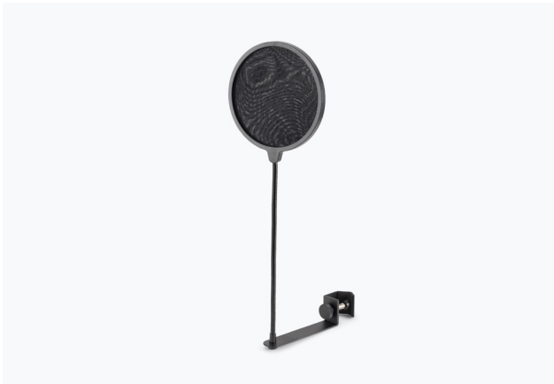
POP BLOCKER WITH CLAMP AND GOOSENECK ASVS6-GB