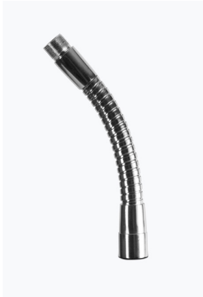
MSA9030-06C / Chrome