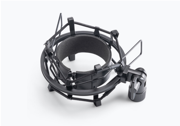
SHOCK MOUNT FOR STUDIO MICS (55 MM–60 MM) MY430