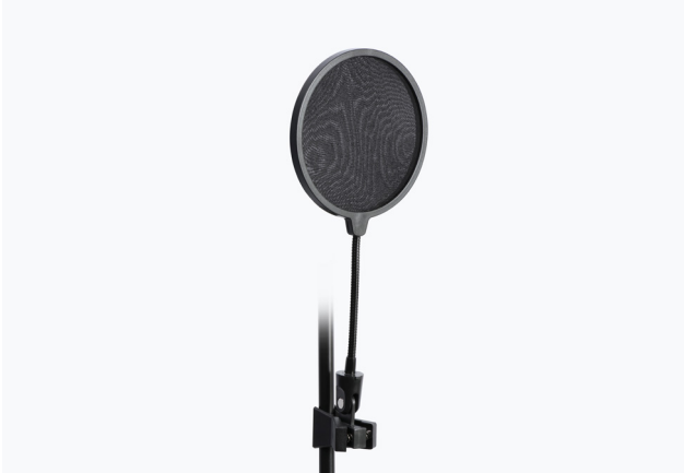
6" POP BLOCKER ASVS6-B