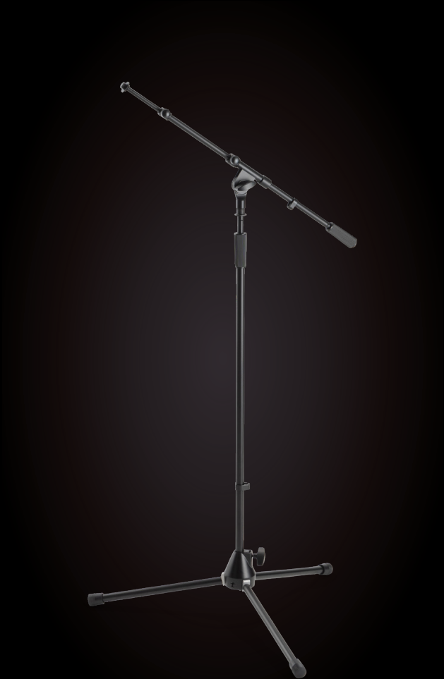
MOST POPULAR MIC STAND WITH TELESCOPING BOOM ARM AND TRIPOD BASE MS9701TB