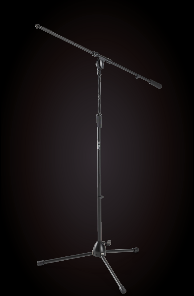
MIC STAND WITH BOOM ARM AND TRIPOD BASE MS9701B