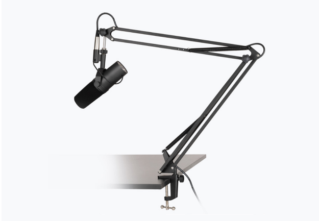
BROADCAST MIC BOOM ARM MBS5000