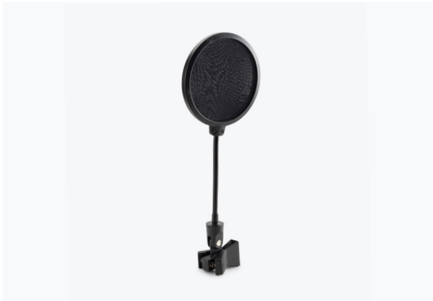
4" POP BLOCKER ASVS4-B