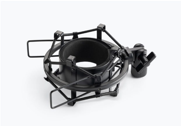
SHOCK MOUNT MY440