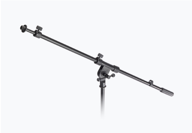
TELESCOPING MIC BOOM MSA7020TB