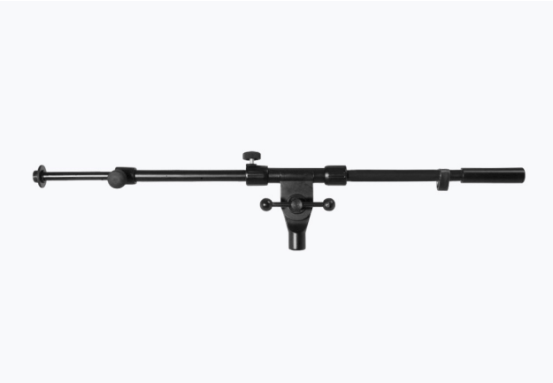
TELESCOPING MIC BOOM MSA9720TB