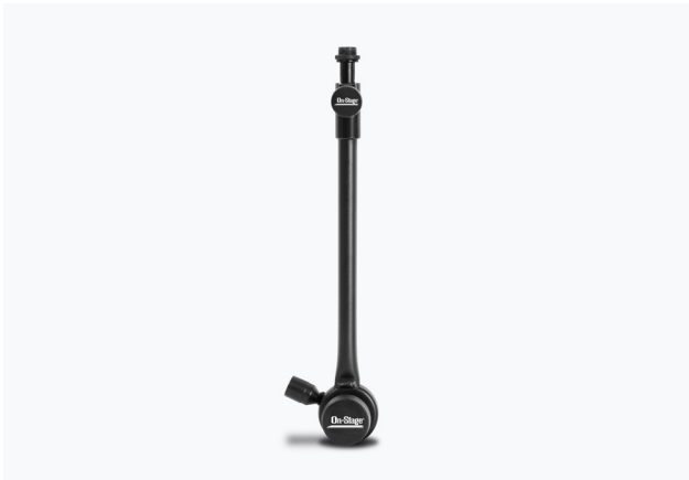
POSI-LOCK TELE BOOM MSA-9505