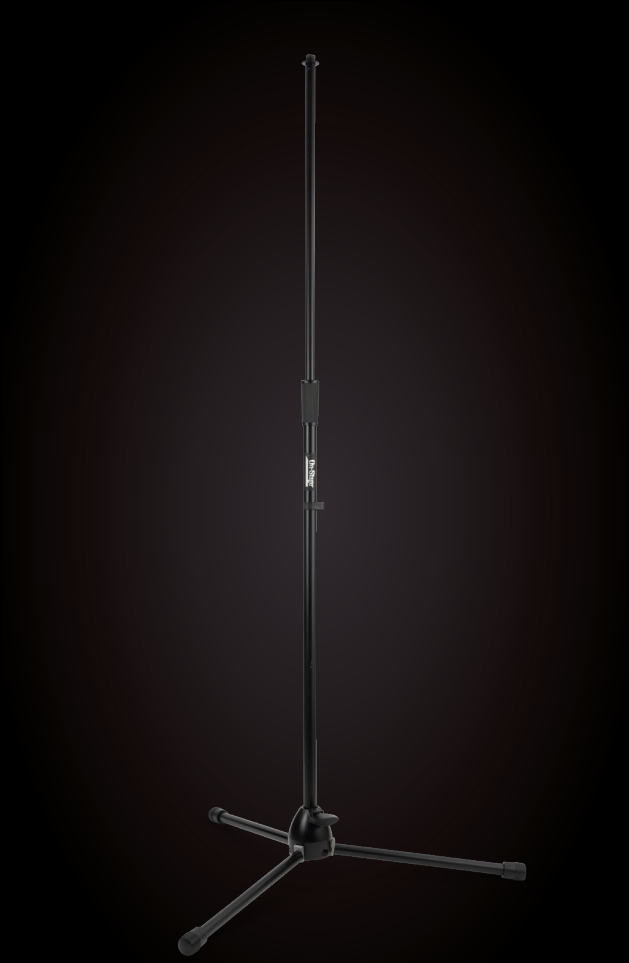
MIC STAND WITH TRIPOD BASE MS9700B