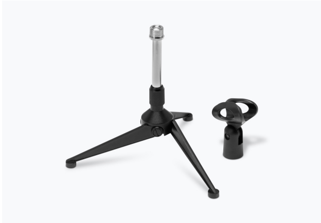
TRIPOD DESKTOP MIC STAND DS7425