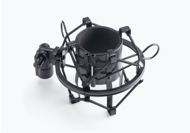
SHOCK MOUNT FOR STUDIO MICS MY410 / Black