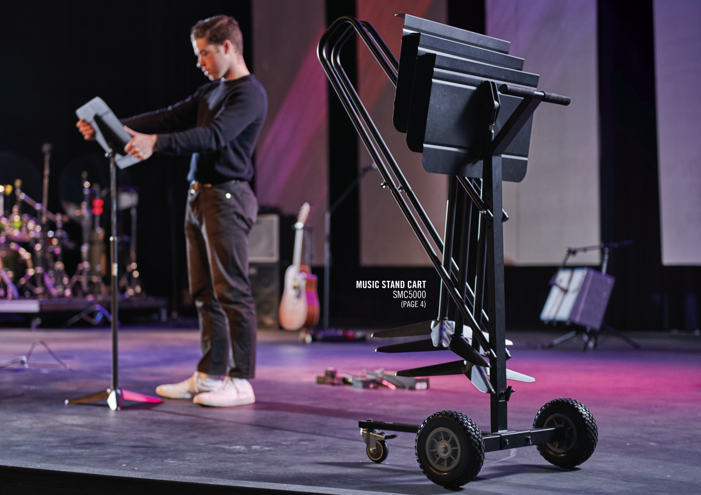
MUSIC STAND CART SMC5000 (PAGE 4)

Includes: Clear tag with paper insert and attaching loop