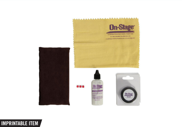
SUPER SAVER KIT FOR VIOLIN VNK5600 Application: Violin maintenance Includes: Rosin, shoulder rest, polishing cloth, fingerboard markers, instruction pamphlet