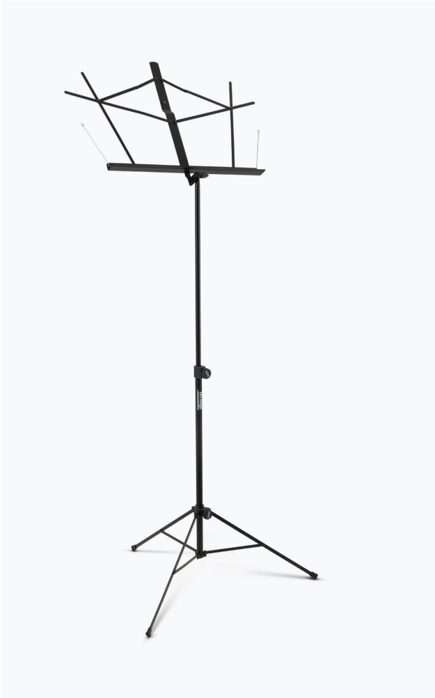
COMPACT SHEET MUSIC STAND SM7122B