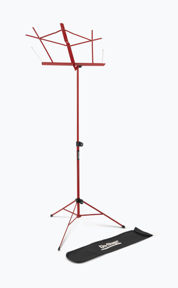
COMPACT SHEET MUSIC STAND WITH BAG SM7122RB