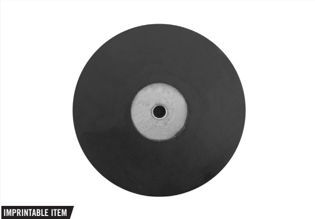
ENDPIN ANCHOR FOR BASS/CELLO CBS1000 Application: Bass / cello