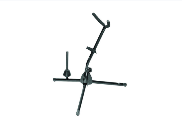
ALTO/TENOR SAXOPHONE STAND WITH FLUTE PEG SXS7101B