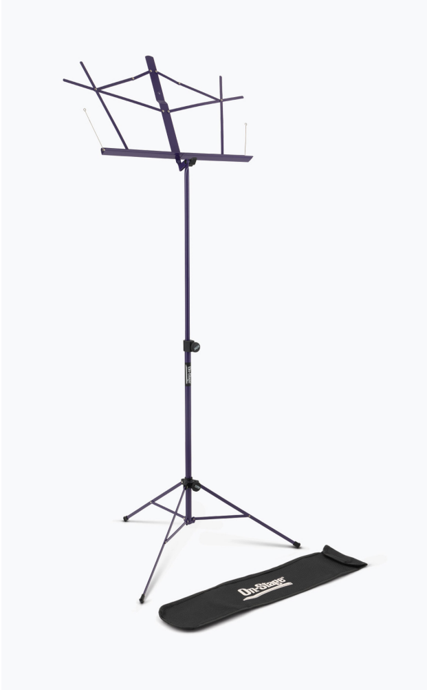
COMPACT SHEET MUSIC STAND WITH BAG SM7122PB