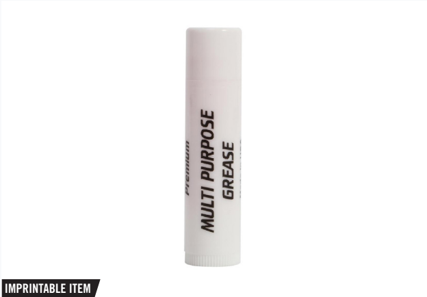
MULTIPURPOSE TUNING SLIDE GREASE TSG1000 / Single TSG1000B / Bulk Application: Brass instrument maintenance Size: 2 oz