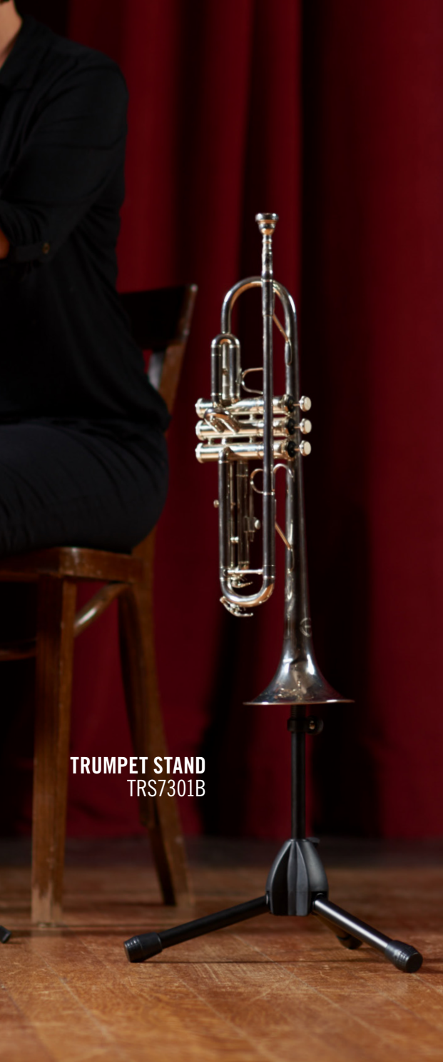
TRUMPET STAND TRS7301B