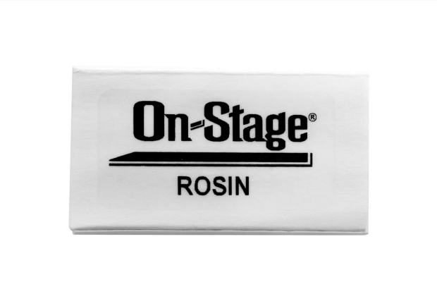
BOW ROSIN (LARGE) BRL1000 Application: Violin / viola / cello maintenance Size: Large