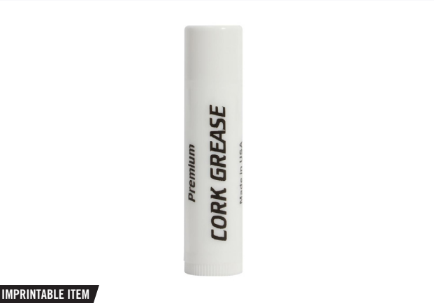
PREMIUM CORK GREASE CGS1500 / Single CGS1500B / Bulk Application: Woodwind instrument maintenance Size: 2 oz