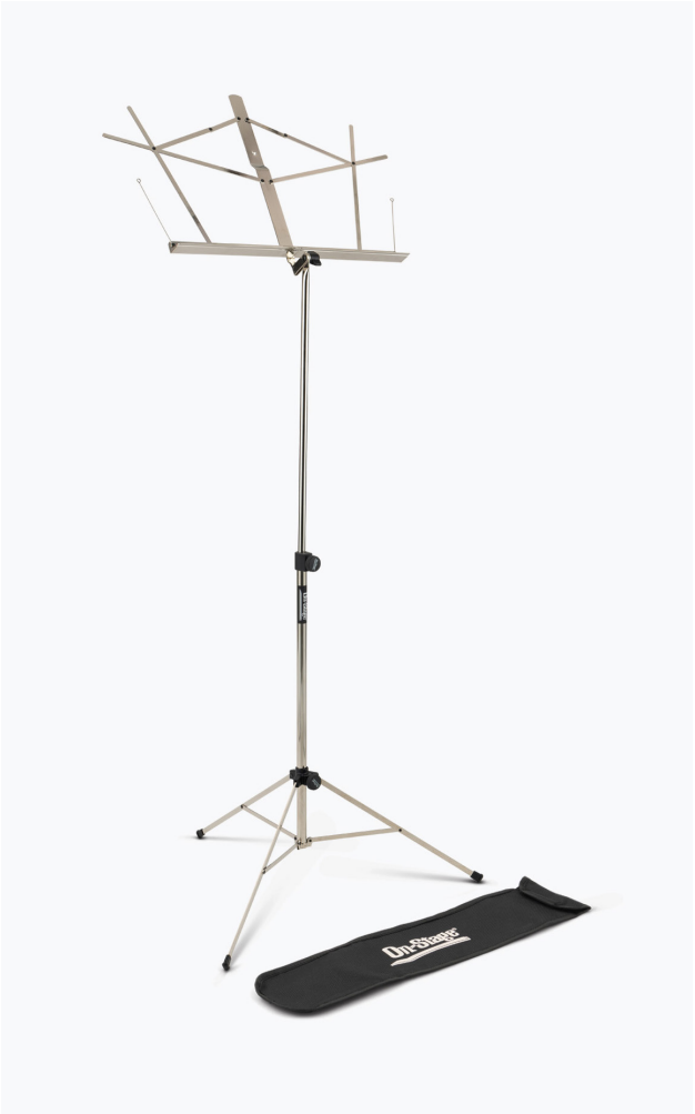
COMPACT SHEET MUSIC STAND WITH BAG SM7122NB