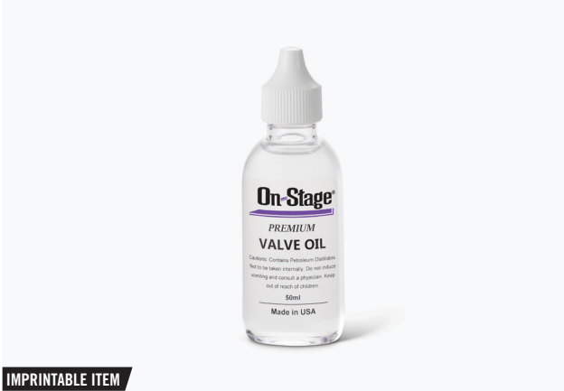
PREMIUM VALVE OIL VOL2000 Application: Brass instrument maintenance Size: 2 oz