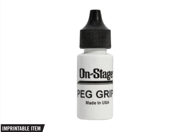
PEG COMPOUND FOR STRINGS VPG1000 Application: Violin / viola / cello maintenance Size: 1 oz