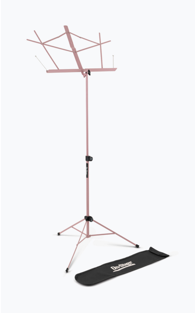
COMPACT SHEET MUSIC STAND WITH BAG SM7122PKB