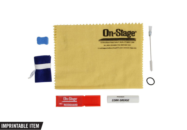
SUPER SAVER KIT FOR CLARINET CLK5600 Application: Clarinet maintenance Includes: Clarinet swab, cork grease, duster brush, wire mouthpiece brush, polishing cloth, reed guard, instruction pamphlet