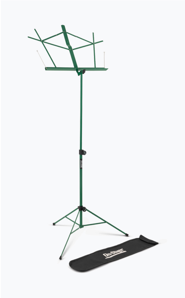
COMPACT SHEET MUSIC STAND WITH BAG SM7122GRB