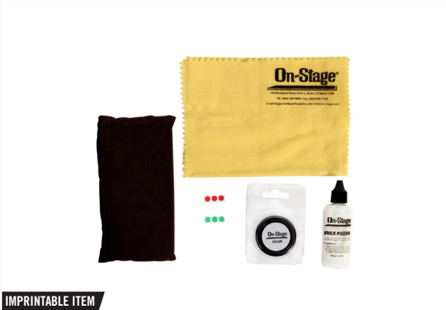
SUPER SAVER KIT FOR VIOLA VAK5600 Application: Viola maintenance Includes: Rosin, shoulder rest, polishing cloth, instrument polish, instruction pamphlet