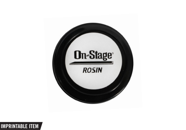
BOW ROSIN (SMALL) BRA1000 Application: Violin / viola / cello maintenance Size: Small