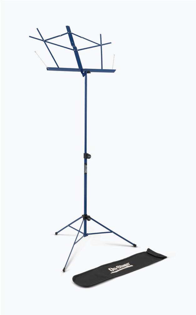
COMPACT SHEET MUSIC STAND WITH BAG SM7122DBB