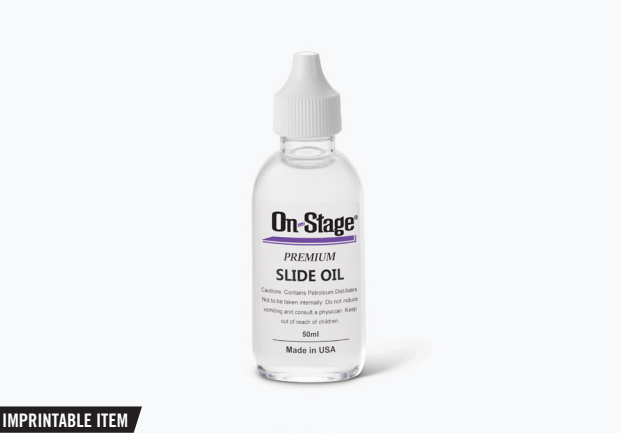
PREMIUM SLIDE OIL SOL2000 Application: Trombone maintenance Size: 2 oz