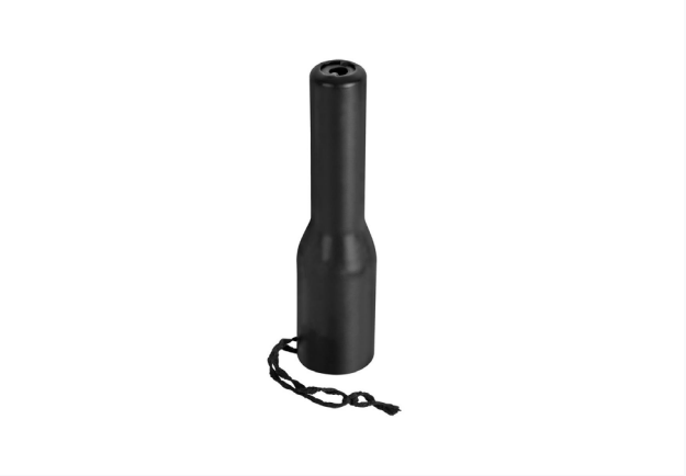
SPEAKER STAND ADAPTER SSA3 Application: Reduces the diameter of a 1.375" speaker pole to 1" Lower Diameter (Female): 1.375" Upper Diameter (Male): 1" Construction: Steel Color: Black