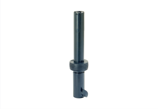
LOCKING SPEAKER ADAPTER SSA45LOK Application: Stabilizes speaker pole/socket connections Length: 12" including 3" speaker-pole overlap Construction: Steel tubing / plastic pressure pads Diameter: 1.375" Color: Black