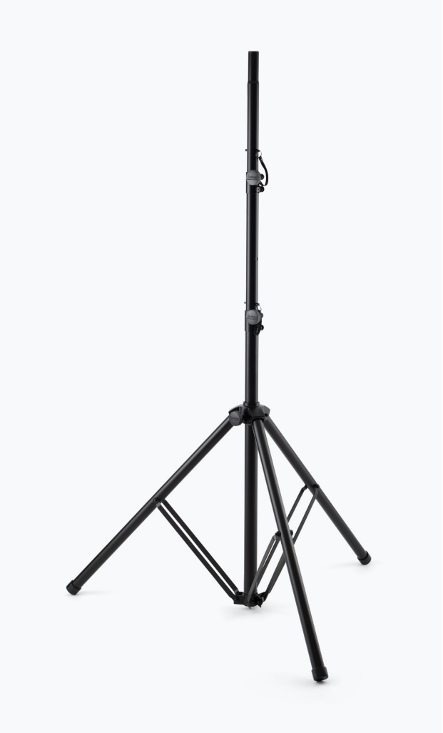
10' LIGHTING / SPEAKER STAND LS-SS7770