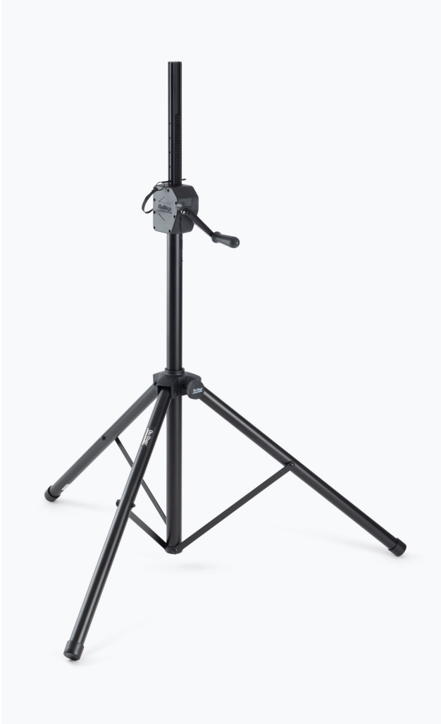
POWER CRANK-UP SPEAKER STAND SS8800B+