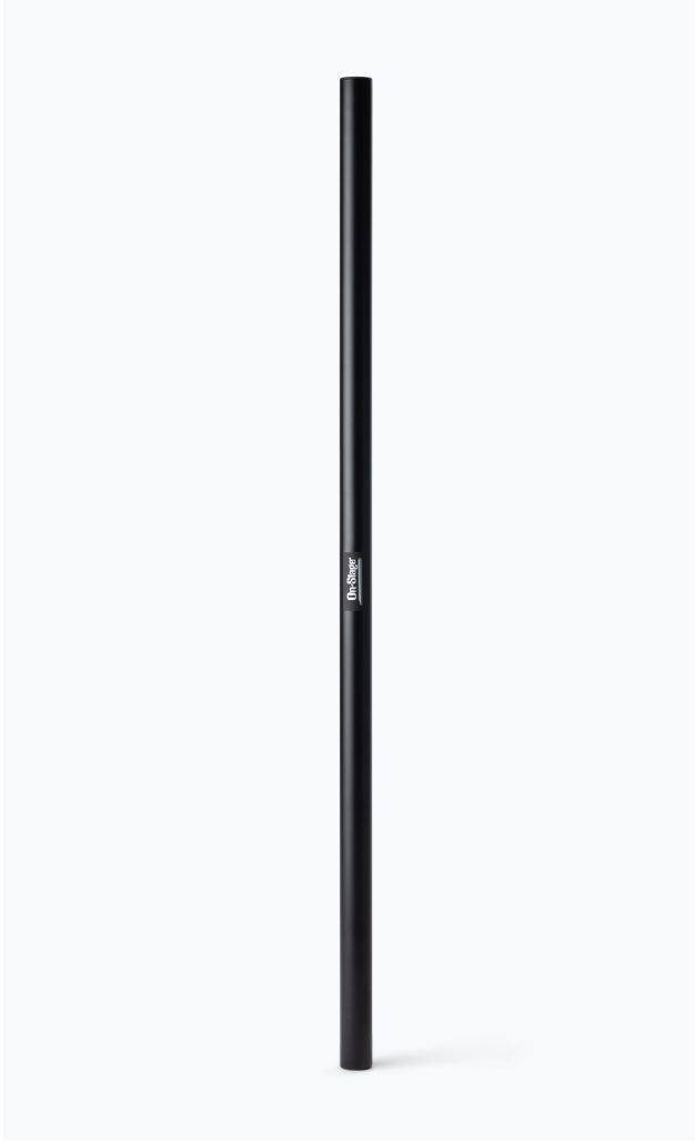
SUBWOOFER ATTACHMENT SHAFT SS7740 Length: 42" Speaker Pole Diameter: 1.375" Weight Capacity: 160 lb Construction: Steel Color: Black