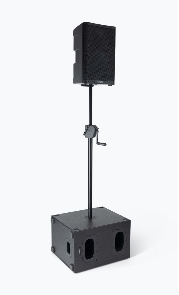
CRANK-UP SUBWOOFER POLE SS7747v2 Length Adjustment: 40"–63" Speaker Pole Diameter: 1.375" Weight Capacity: 145 lb Construction: Steel Color: Black