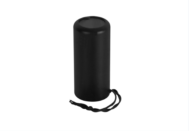
ADAPTER SLEEVE FOR SPEAKER BRACKETS SSA2 Application: Increases the diameter of a 1.375" speaker pole to 1.5" Inner Diameter: 1.375" Outer Diameter: 1.5" Construction: Steel Color: Black