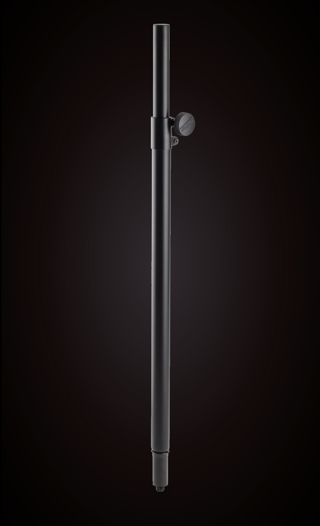
AIRLIFT SPEAKER POLE SS7748 Length Adjustment: 36.5"–60" Speaker Pole Diameter: 1.375" Weight Capacity: 100 lb Construction: Steel Color: Black

PRODUCTION-GRADE DESIGNED FOR PROFESSIONALS