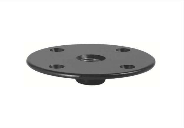
M20 SPEAKER CABINET ADAPTER SSA20M Application: Replaces a 1.375" pole-mount socket with an M20-threaded socket Includes: 4 mounting screws Construction: Steel Color: Black