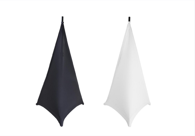
SPEAKER / LIGHTING STAND SCRIM SSA100B / Black SSA100W / White Construction: Stretch nylon Color: Available in black or white