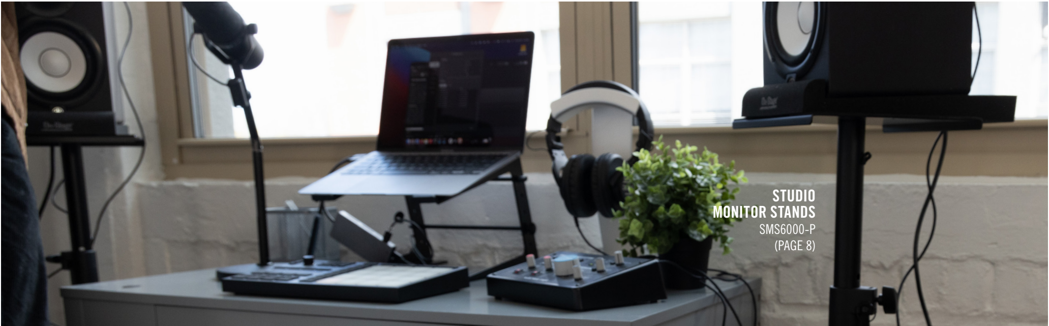
STUDIO MONITOR STANDS SMS6000-P (PAGE 8)