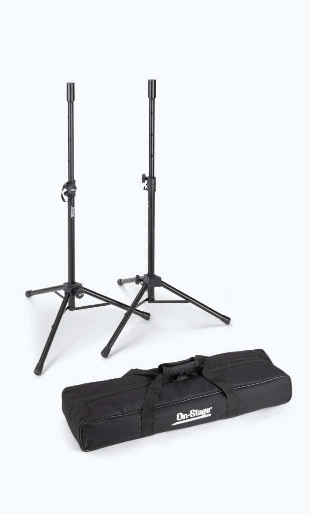
MINI SPEAKER STAND PACK SSP7000