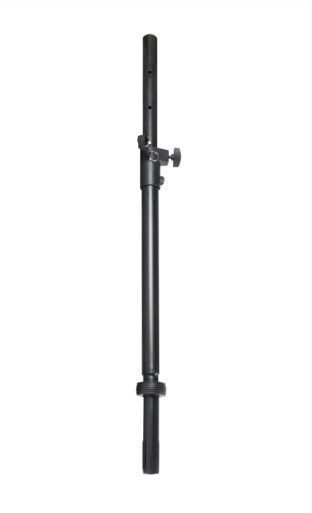
ADJUSTABLE SUBWOOFER ATTACHMENT SHAFT SS7745L0K Length Adjustment: 32.5"–47" Speaker Pole Diameter: 1.375" Weight Capacity: 100 lb Construction: Steel Color: Black

PRODUCTION-GRADE DESIGNED FOR PROFESSIONALS