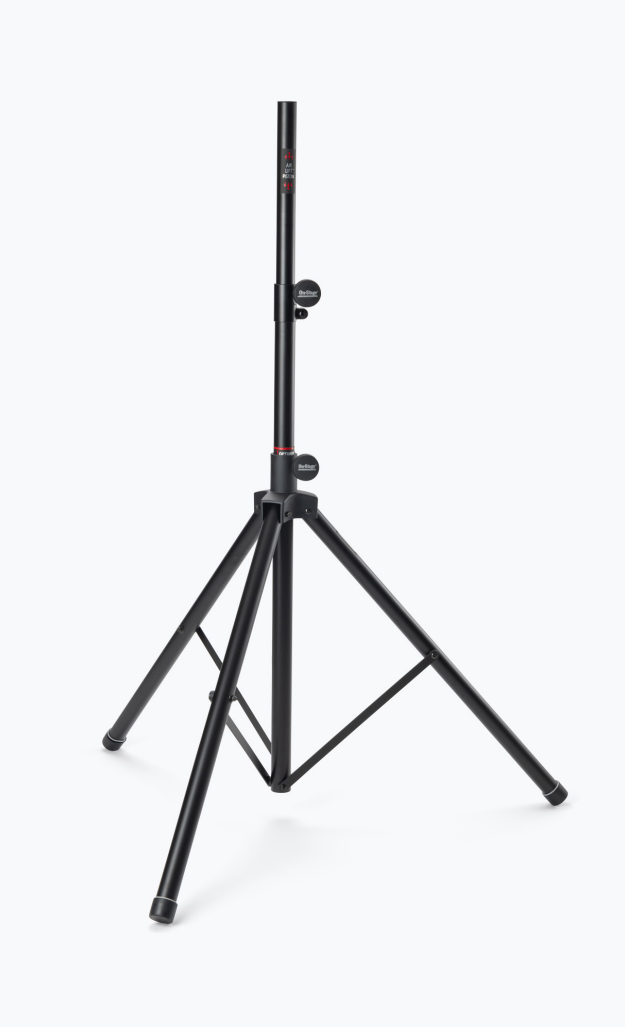
AIR-LIFT SPEAKER STAND SS7764B