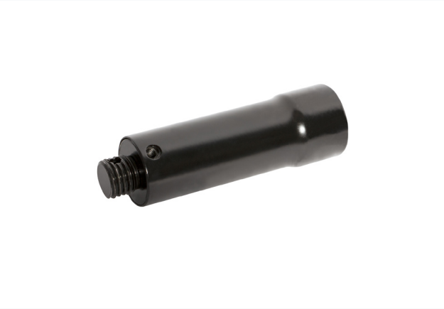
SUBWOOFER ADAPTER SSA21 Application: Enables an M20-threaded speaker-stand shaft to connect to virtually any subwoofer pole-mount socket Lower Adapter: 1.375" with a removable male M20-threaded stem Upper Adapter: Female M20 Construction: Steel Includes: Hex key for M20 stem removal