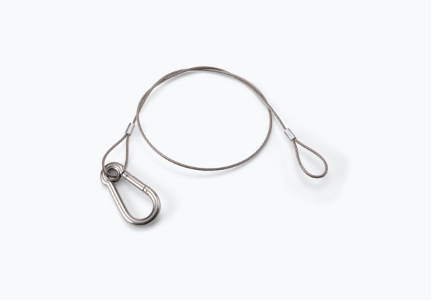
SAFETY CABLE SSACB28 Application: Backup attachment for overhead equipment Thickness: 3 mm Length: 28" Maximum Load: 60 lb Construction: Steel Includes: Carabiner