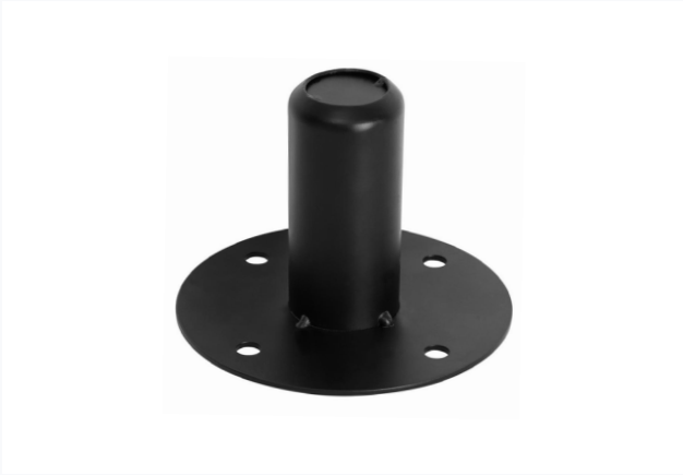
SPEAKER CABINET INSERT SSA1.375 SSA1.5 Application: Adds a pole-mount socket to a speaker Construction: Steel SSA1.375 Diameter: 1.375" SSA1.5 Diameter: 1.5"