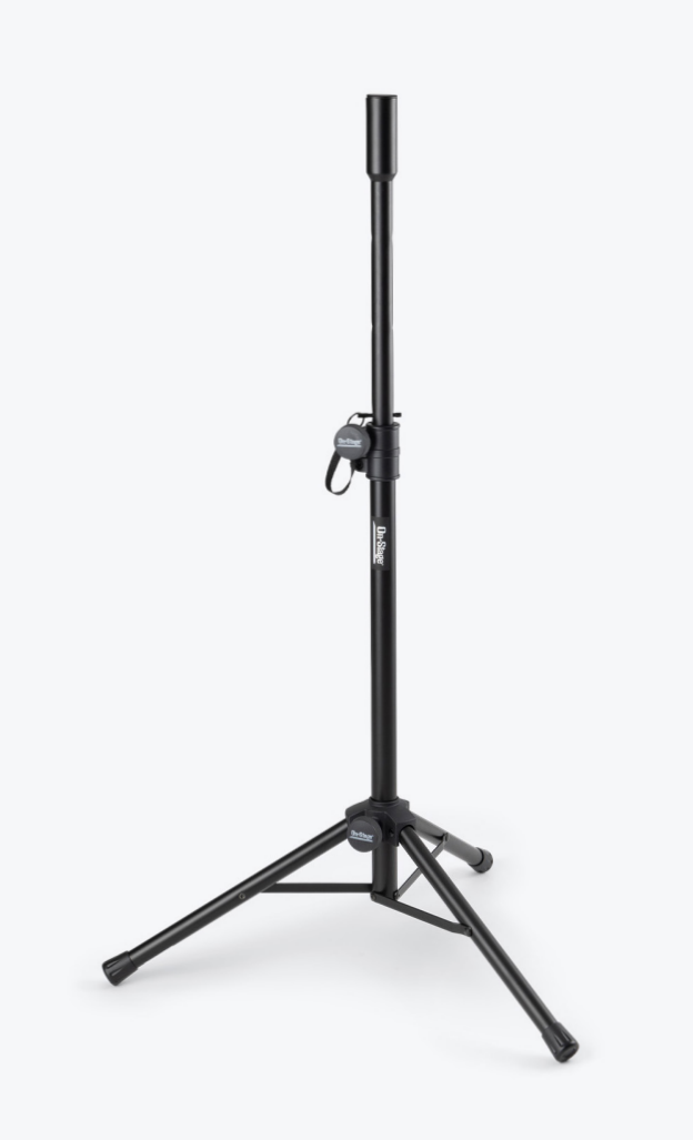
MINI ADJUSTABLE SPEAKER STAND SSAS7000B