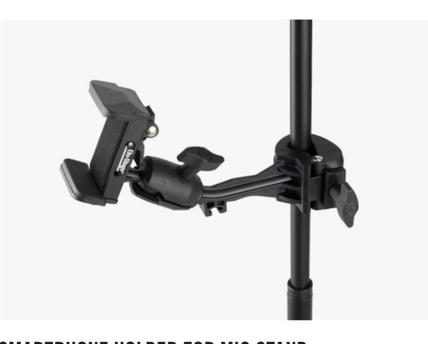
SMARTPHONE HOLDER FOR MIC STAND TCM500

Phone Clamp Opening Adjustment: 2.37"-4"