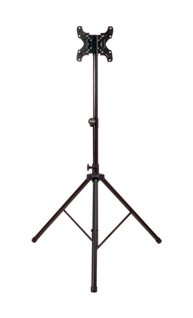
AIR-LIFT FLAT SCREEN MOUNT FPS6000