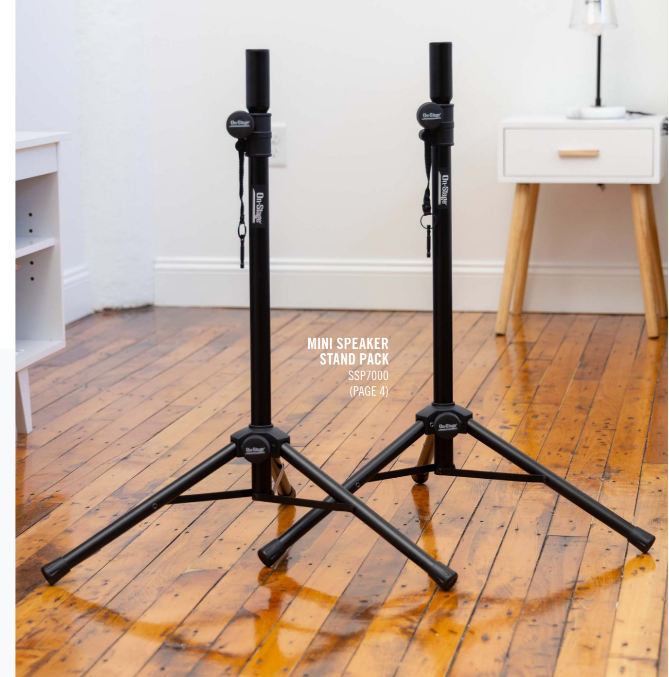
MINI SPEAKER STAND PACK SSP7000 (PAGE 4)