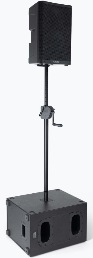
CRANK-UP SUBWOOFER POLE SS7747v2

Length Adjustment: 31.625"–55" Speaker Pole Diameter: 1.375" Weight Capacity: 80 lb Construction: Steel Color: Black