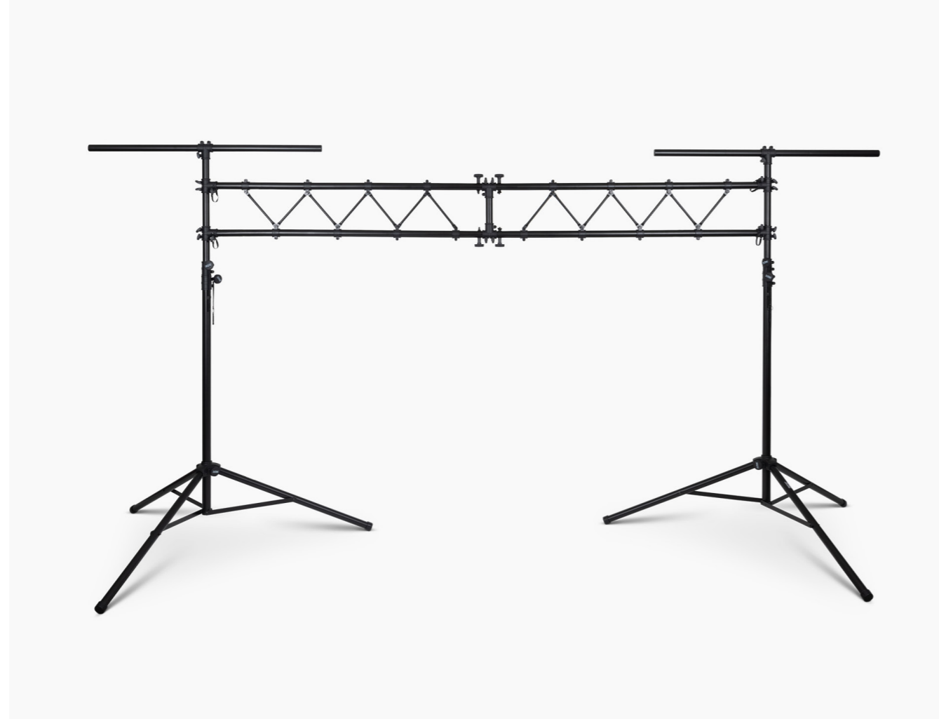
LIGHTING STAND WITH TRUSS LS7730