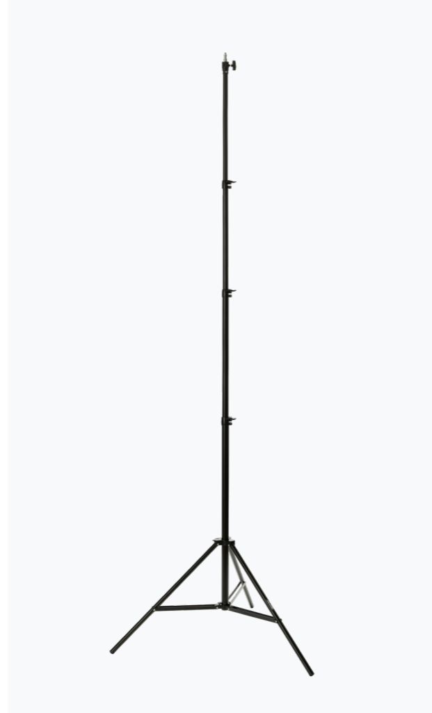
13' TRIPOD LIGHTING/MIC STAND LS-MS7620