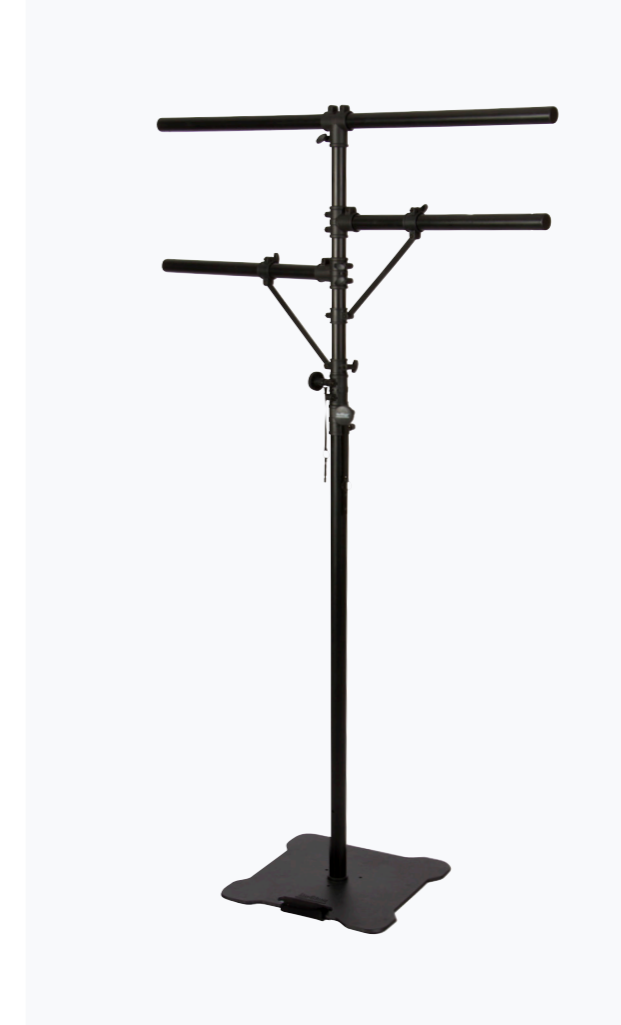
FLAT-BASE LIGHTING STAND LS7920BLT