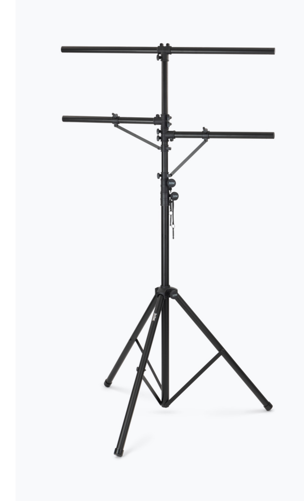
LIGHTING STAND WITH SIDE BARS LS7720BLT