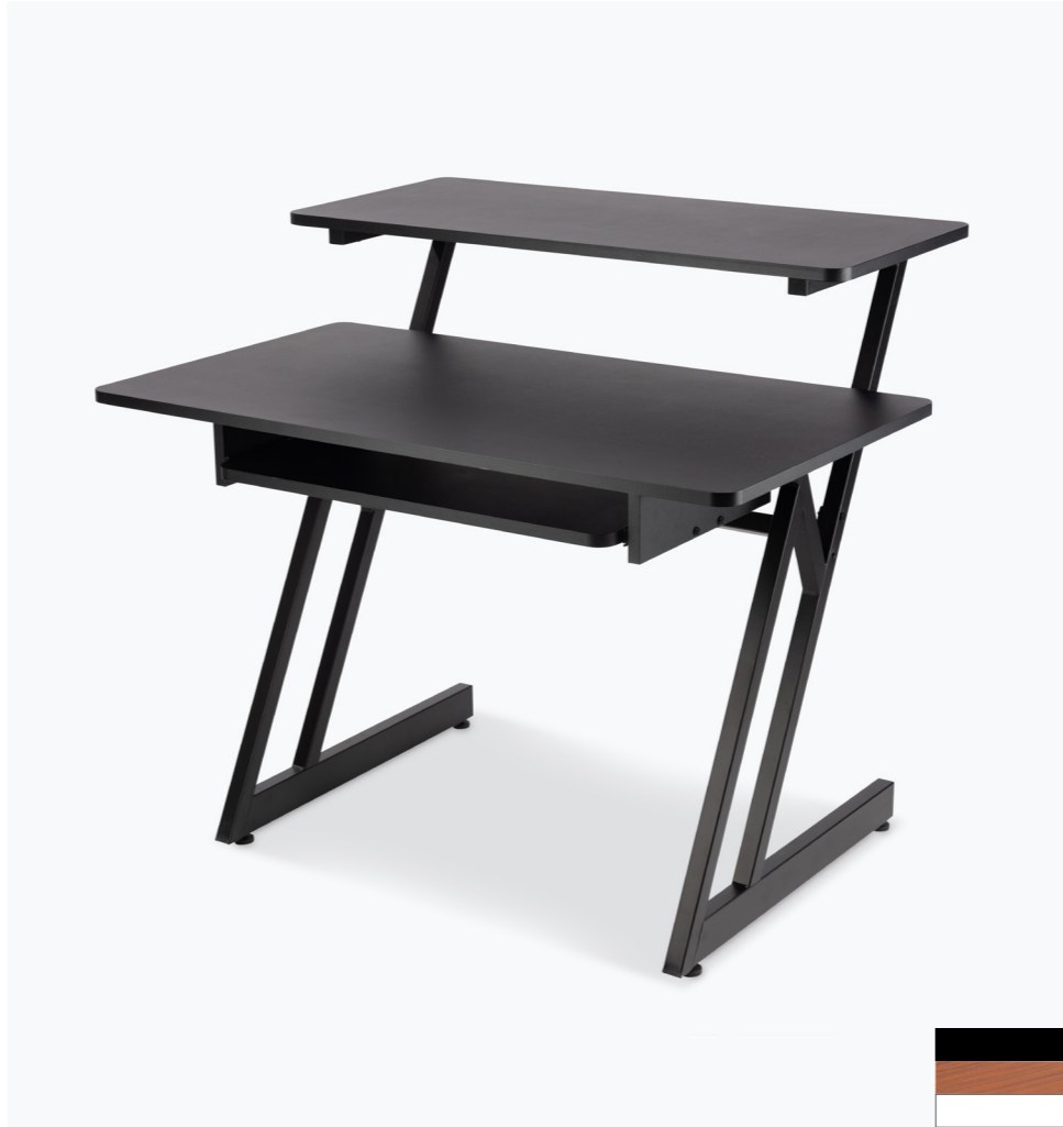
WOOD WORKSTATION WS7500B / Black S7500RB / Rosewood WS7500W / White Dimensions: 43" (W) x 38" (H) x 23.5" (D) Weight Capacity: 175 lb Desktop Height: 29" Construction: Wood / steel Upper Platform Height: 37.5" Color: Black or rosewood Keyboard Tray Height: 25"