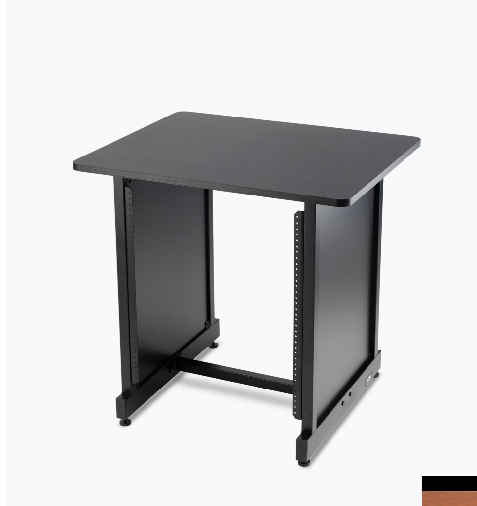
RACK CABINET WSR7500B / Black WSR7500RB / Rosewood Dimensions: 30" (L) x 23.8" (W) Construction: Laminated wood / steel Height Adjustment with Feet: 29"-30" Color: Black or rosewood Height with Casters: 30.5" Includes: 4 casters (2 locking)