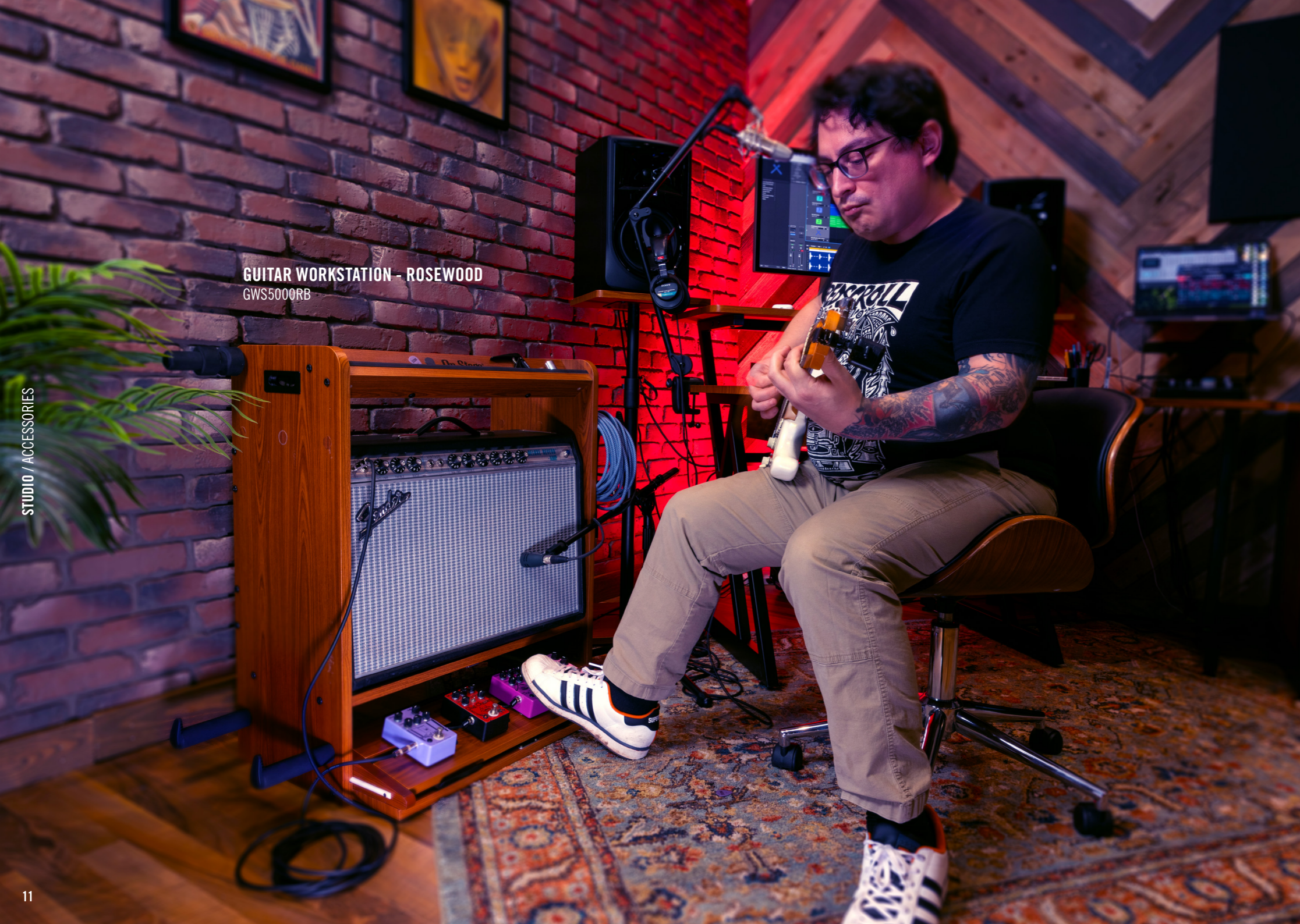
GUITAR WORKSTATION - ROSEWOOD GWS5000RB