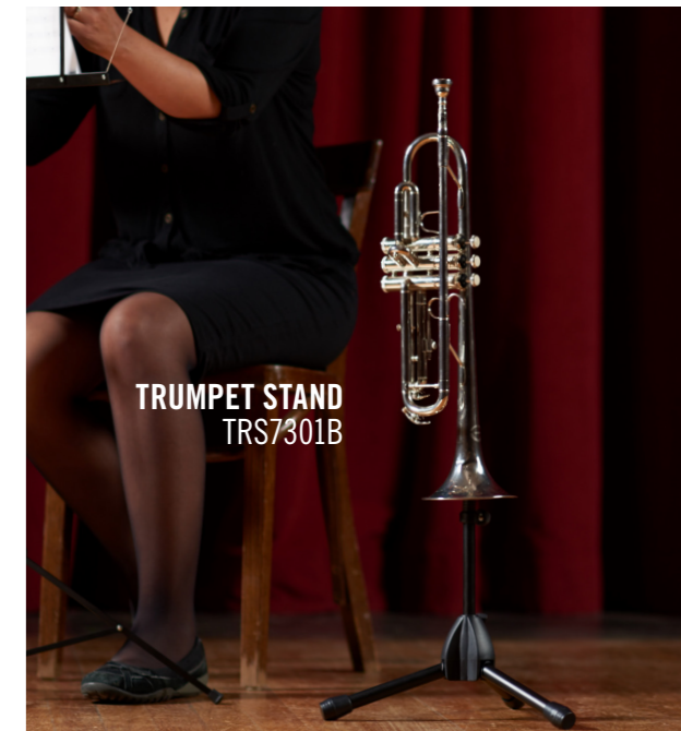
TRUMPET STAND TRS7301B