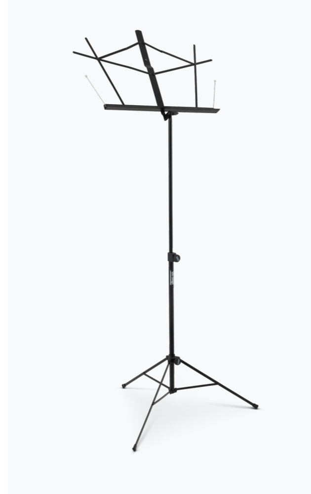
COMPACT SHEET MUSIC STAND SM7122B

Bookplate Dimensions: 9" (foldable)* Base Spread: 18"-21" Height Adjustment: 26"-40" Color: Black Construction: Steel