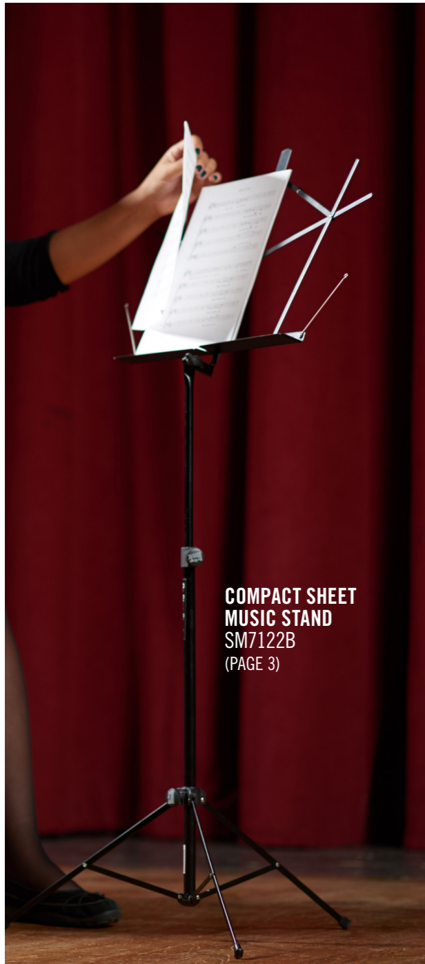
COMPACT SHEET MUSIC STAND SM7122B (PAGE 3)