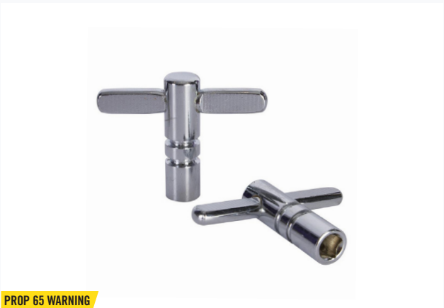
DRUM KEY P.O.P. CONTAINER DKA100 / 12878 Size: Fits all standard 0.25" square-socket tension rods Construction: Chrome plated metal