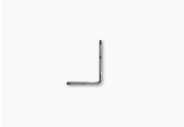
PERCUSSION L ROD PRL1020 / 14463 Diameter: 9.5 mm Construction: Chrome-plated steel Dimensions: 6.25" (L) x 5.25" (W)