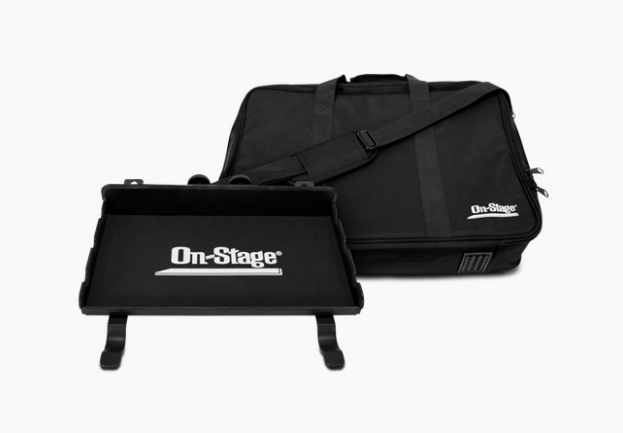
PERCUSSION TRAY WITH SOFT CASE DPT4000 / 14290