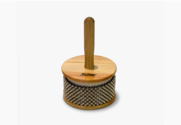
STANDARD CABASA HPCS3500 / 14483