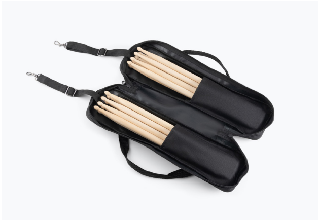
TWO-POCKET DRUM STICK BAG DSB6500 / 35534