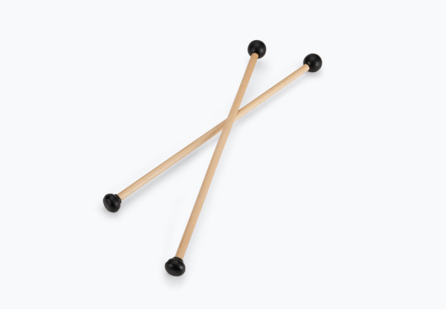
PERCUSSION MALLETS WPM100 / 13890