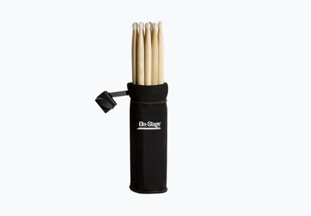
CLAMP-ON DRUM STICK HOLDER DA-100 / 12028