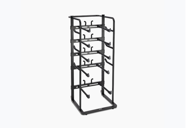
SNARE DRUM RACK DRS9000 / 14294