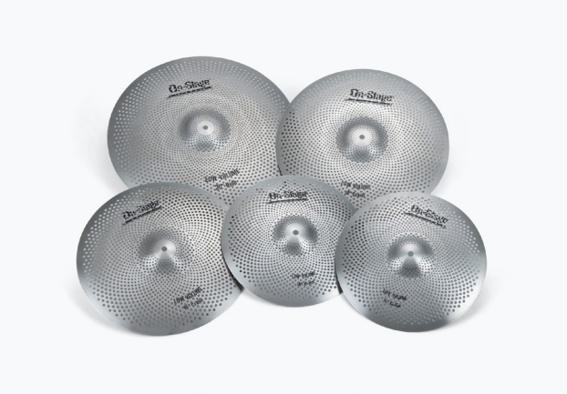
LOW VOLUME CYMBAL PACK LVCP5000 / 14914