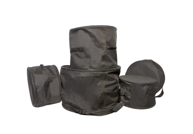
STANDARD PADDED DRUM BAG SET DPB3000 / 14054