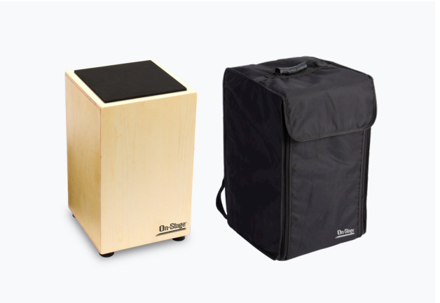
FIXED-SNARE CAJON WFC3200 / 12745