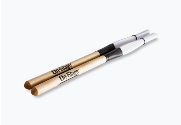
WOOD CAJON BRUSHES WCB100 / 13373