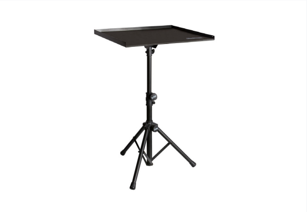
PERCUSSION TABLE DPT5500B / 13232