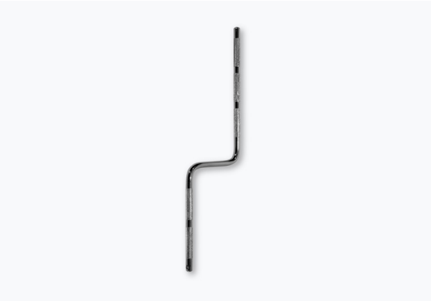
PERCUSSION Z ROD PRZ1030 / 14465 Diameter: 9.5 mm Construction: Chrome-plated steel Dimensions: 13" (L) x 3.5" (W)