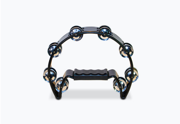
HANDHELD TAMBOURINE TMB3200 / 14471