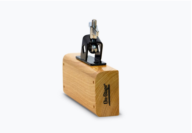
WOODBLOCK HPWB2700 / 14573