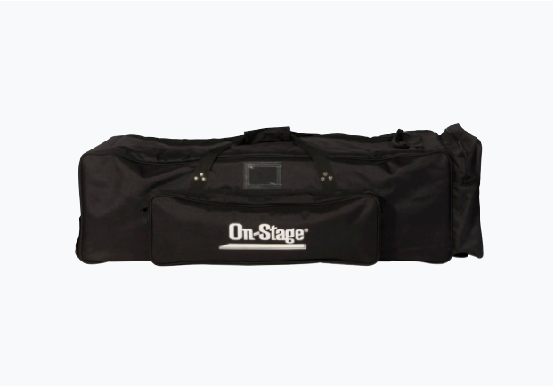
DRUM HARDWARE BAG DHB6000 / 14185