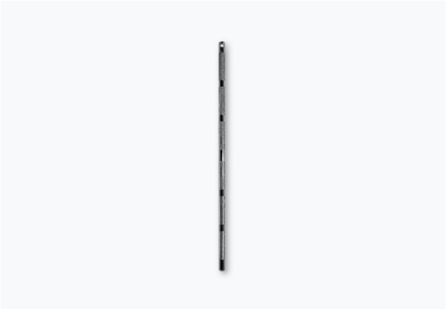
PERCUSSION ROD, STRAIGHT PRL1010 / 14464 Diameter: 9.5 mm Construction: Chrome-plated steel Dimensions: 13" (L)