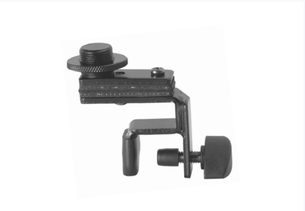
DRUM RIM MIC CLIP DM01 / 11980 Mic Mount Threading: 5/8"-27 Color: Black