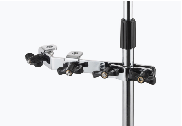
PERCUSSION MOUNT DPM2200 / 14850 Construction: Chrome-plated steel Color: Chrome / Black Eyebolt Size: Fits percussion rods up to 11 mm in diameter