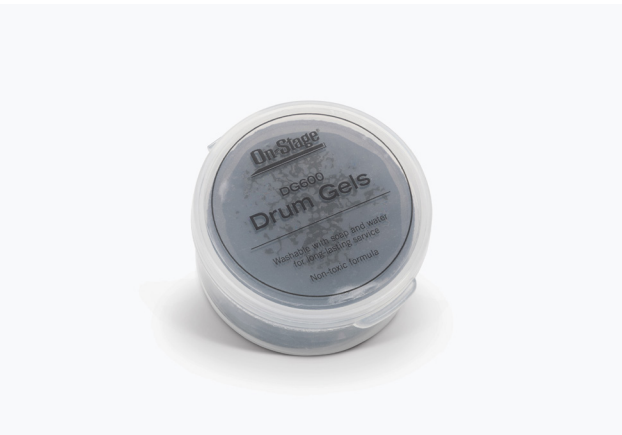
DRUM GELS DG600 / 14828 Quantity: 6 Color: Black Thickness: 3 mm