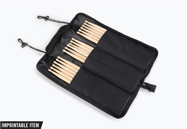
THREE-POCKET DRUM STICK BAG DSB6700 / 13471