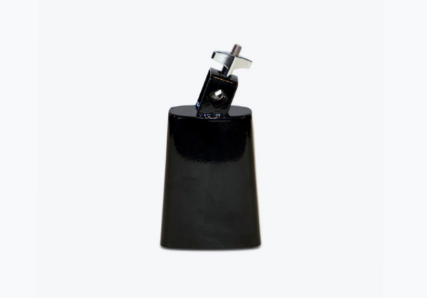
5" COWBELL HPCB2500 / 14468