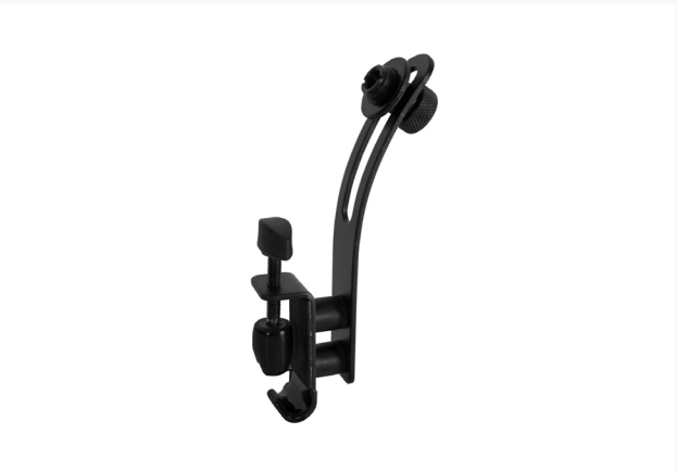
DRUM RIM MIC CLIP DM50 / 12939 Mic Mount Threading: 5/8"-27 Color: Black