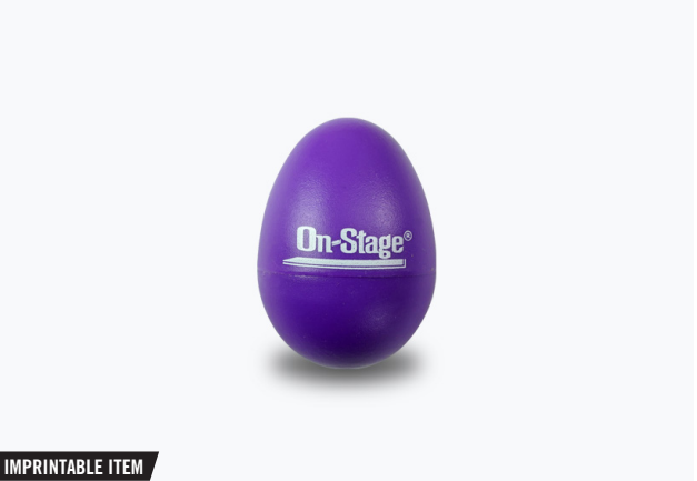
24 PACK OF EGG SHAKERS HPS1240 / 14753