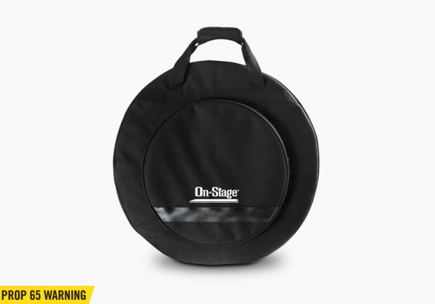
DELUXE CYMBAL BAG CB4000 / 14045