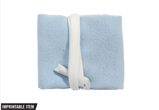
MICROFIBER SWAB FOR CLARINET CFS3000 / 12781

Application: Alto saxophone maintenance Construction: Microfiber