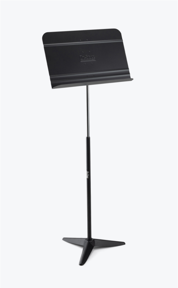
ORCHESTRA MUSIC STAND SM7711B / 12681