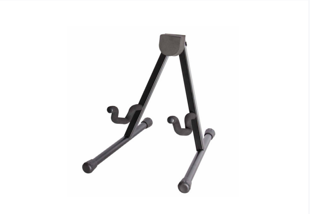
FRENCH HORN STAND FHS7201B / 13405