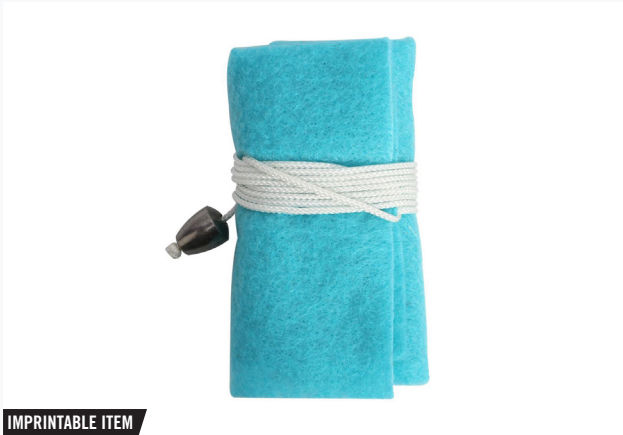
SYNTHETIC SWAB FOR ALTO SAXOPHONE SAS2000 / 12773

Application: Instrument maintenance Size: 12" x 12"