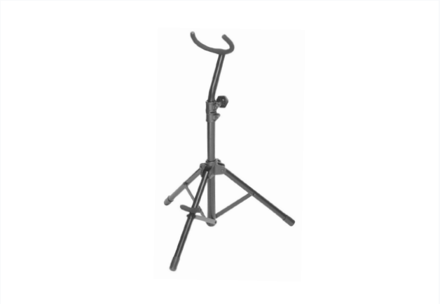
BARITONE SAXOPHONE STAND SXS7501B / 12578