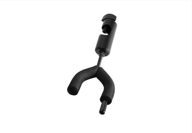
VIOLIN HANGER FOR MUSIC STANDS VS7200 / 12095