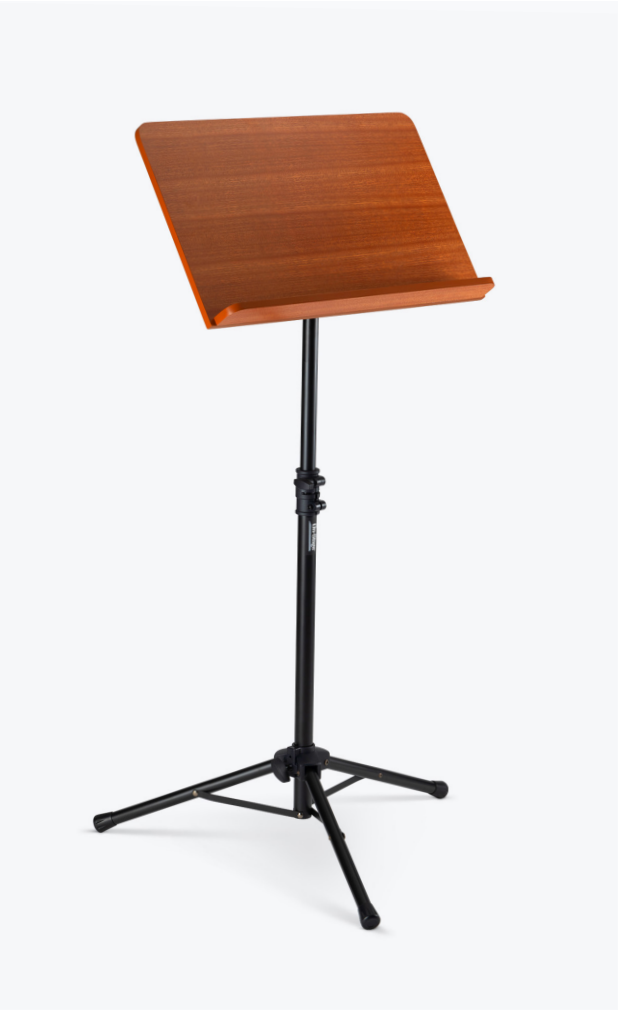
MUSIC STAND WITH WIDE ROSEWOOD BOOKPLATE SM7312W / 11188