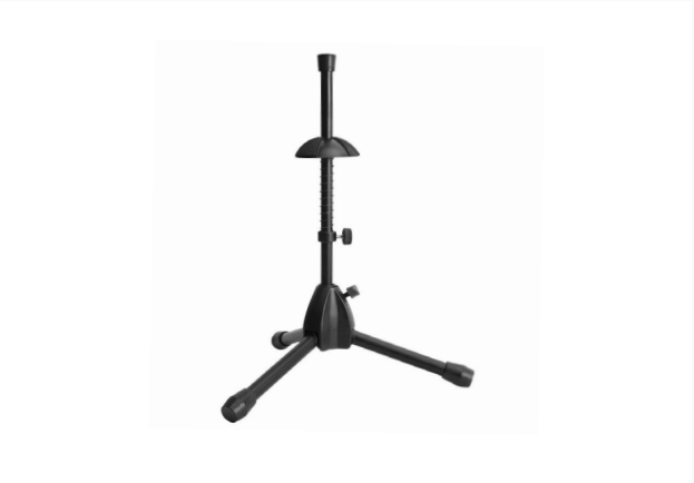
TRUMPET STAND TRS7301B / 12577