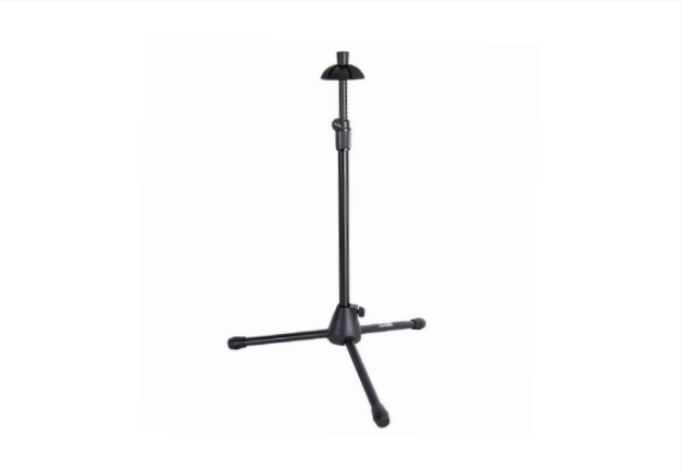
TROMBONE STAND TS7101B / 12574