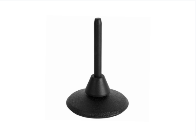
CLARINET OR FLUTE STAND FS7000B / 12579