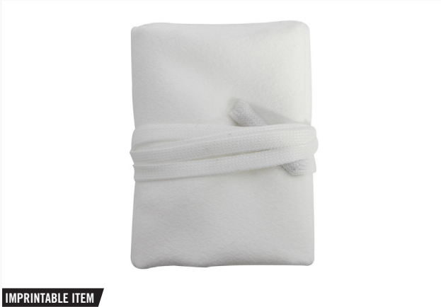
MICROFIBER SWAB FOR ALTO SAXOPHONE SFS3000 / 12782

Application: Alto saxophone maintenance Construction: Microfiber