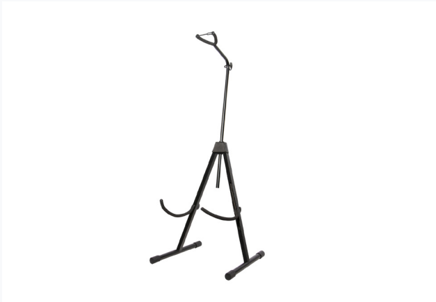
CELLO/BASS STAND CS7201 / 14036