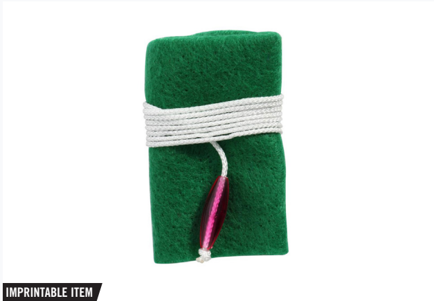
SYNTHETIC SWAB FOR CLARINET CRS1000 / 12771

Application: Alto saxophone maintenance Construction: Synthetic fiber