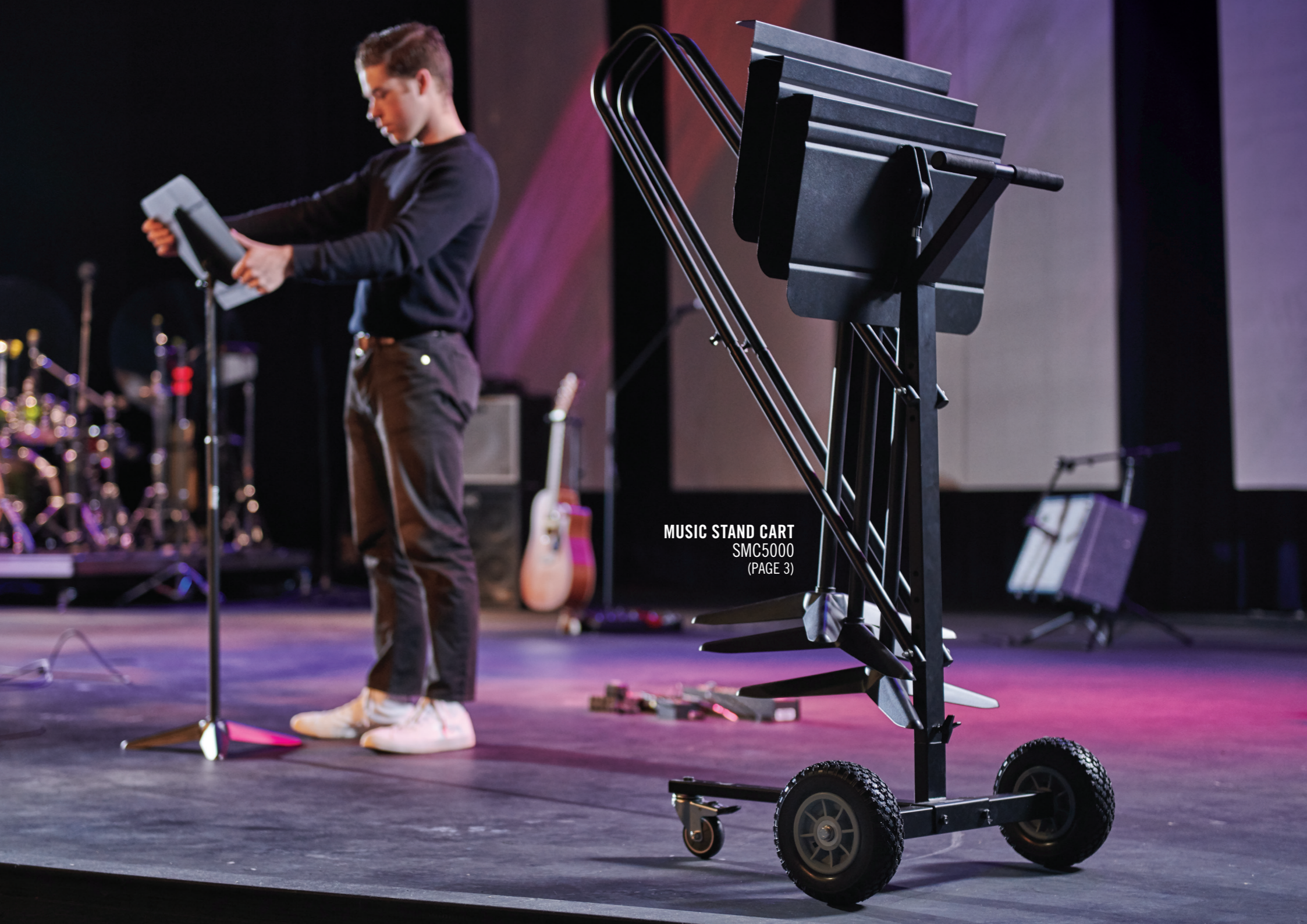
MUSIC STAND CART SMC5000 (PAGE 3)