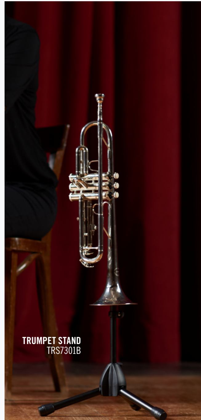
TRUMPET STAND TRS7301B