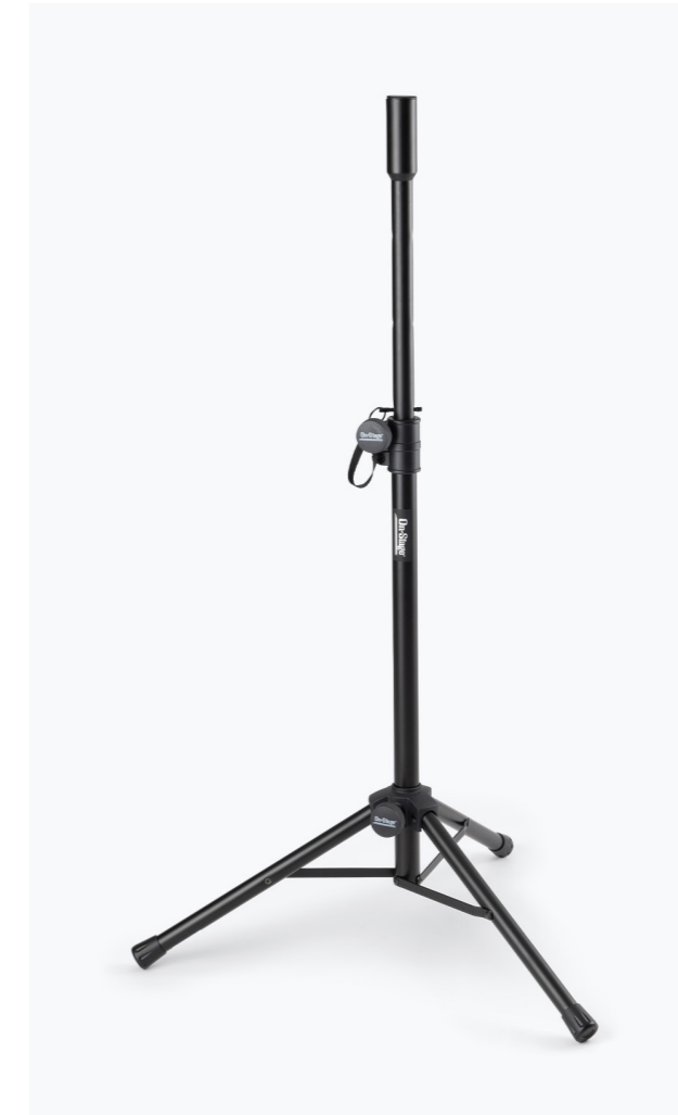
MINI ADJUSTABLE SPEAKER STAND SSAS7000B