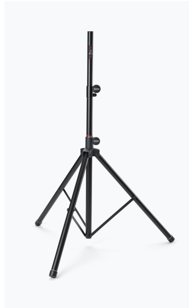
AIR-LIFT SPEAKER STAND SS7764B