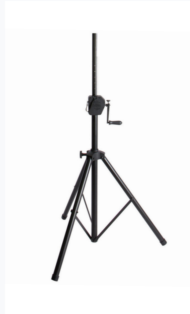
POWER CRANK-UP SPEAKER STAND SS8800B+

Speaker Pole Diameter: 1.375" (1.5" adapter included)