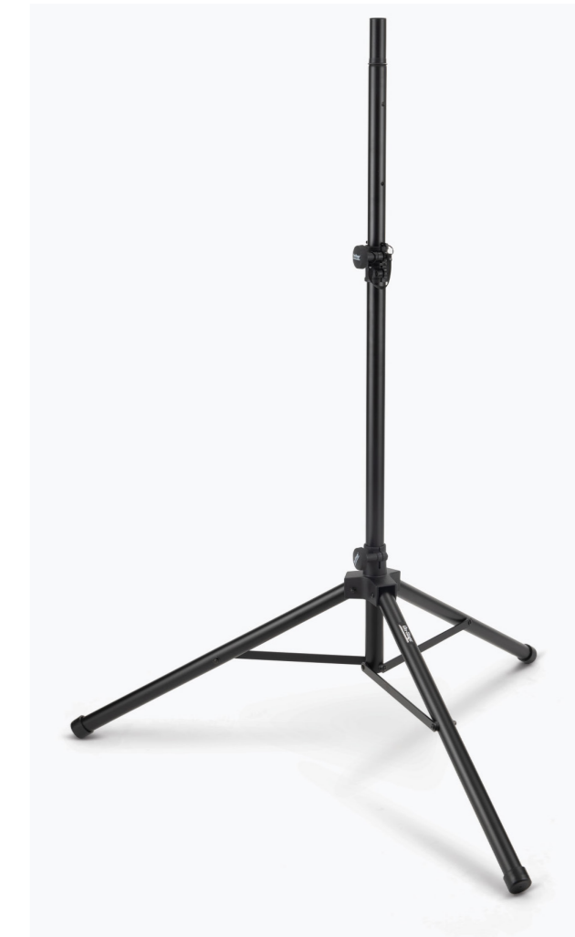
ALL-ALUMINUM SPEAKER STAND SS7761B

Construction: Steel / aluminum Color: Black