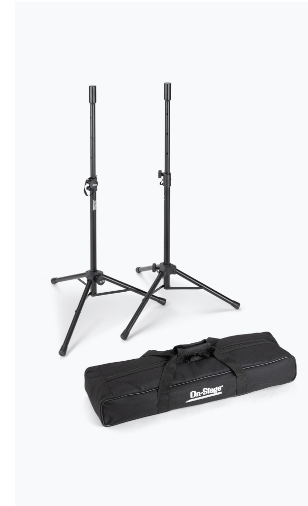
MINI SPEAKER STAND PACK SSP7000

Reversible Speaker Pole Diameter: 1.375"