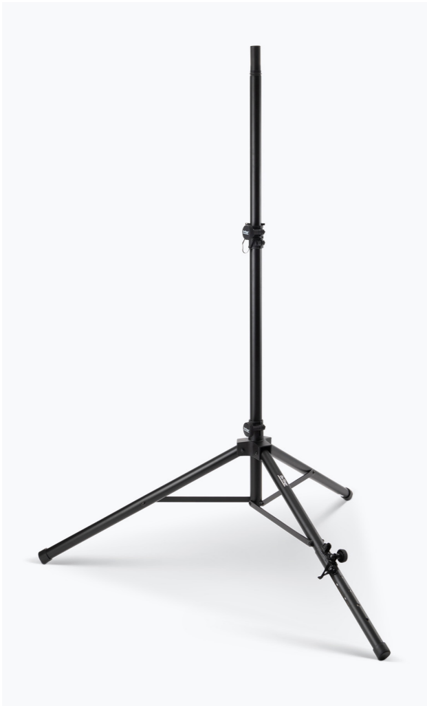
SPEAKER STAND WITH ADJUSTABLE LEG SS7762B

Reversible Speaker Pole Diameter: 1.375" or 1.5"