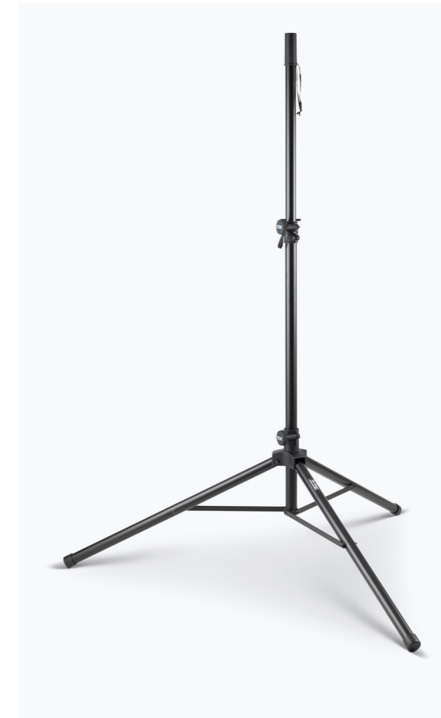
CLASSIC SPEAKER STAND SS7730B

Speaker Pole Diameter: 1.375" (1.5" adapter included)