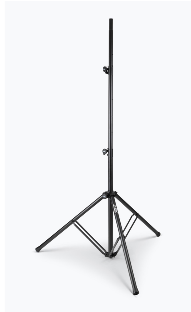
10' LIGHTING / SPEAKER STAND LS-SS7770