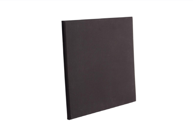
ACOUSTIC 1" PANEL FOR PROFESSIONAL APPLICATIONS AP3500 / 12971