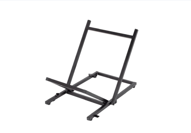
FOLDABLE TILT-BACK AMP STAND RS6000 / 11180