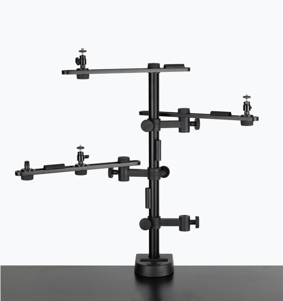
PRODUCTION STATION WS3500 / 14752