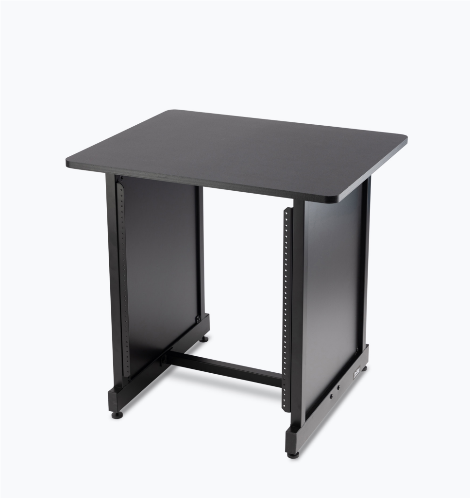
RACK CABINET WSR7500B / 12508 / Black WSR7500RB / 12507 / Rosewood