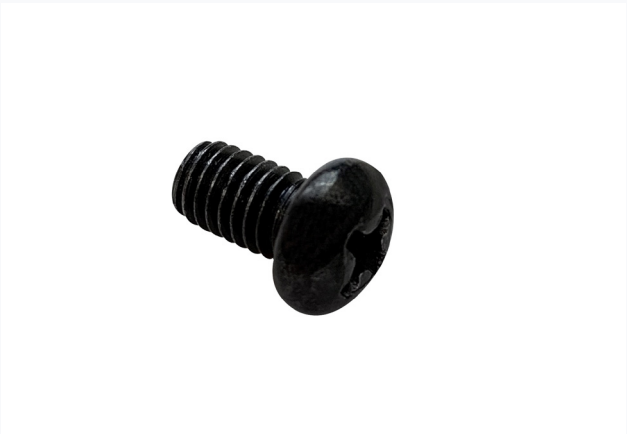
PACK OF RACK SCREWS WSR7100 / 14080 / 100 Pack WSR7025 / 14276 / 25 Pack