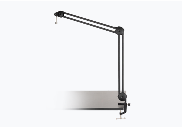
PROFESSIONAL STUDIO BOOM ARM MBS7500 / 12623