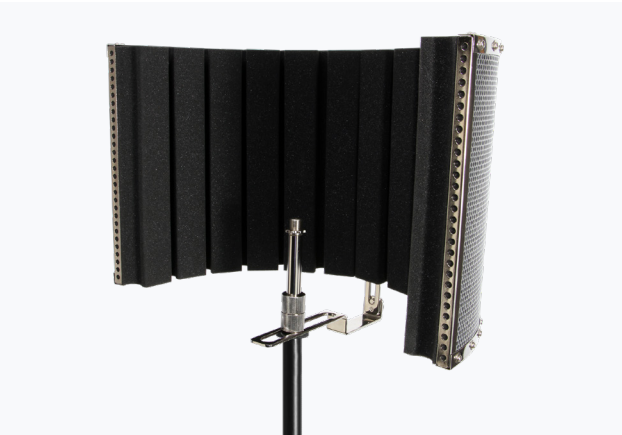
ISOLATION SHIELD ASMS4730 / 12815