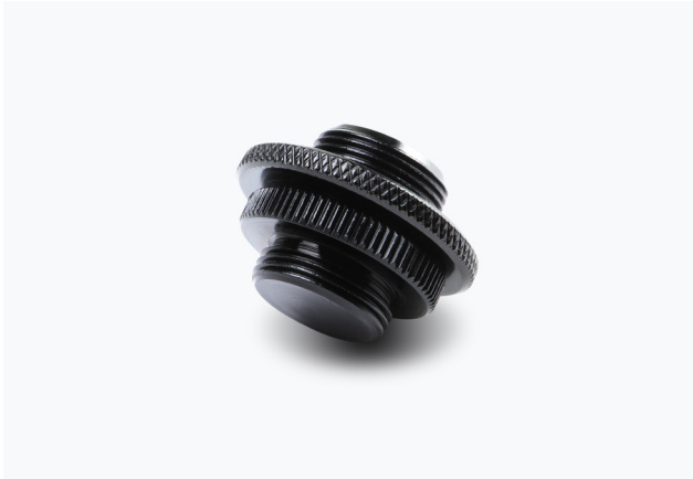
U-MOUNT® MALE-TO-MALE ADAPTER UM-99 / 10486