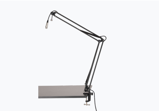
BROADCAST MIC BOOM ARM MBS5000 / 12550