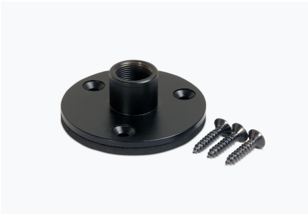
U-MOUNT® DESK FLANGE MOUNT UM5006 / 12056