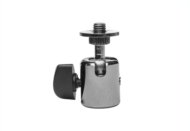
U-MOUNT® BALL JOINT ADAPTER UM-01 / 11745