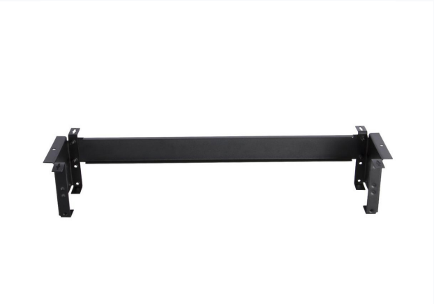
DUAL-SPACE RACK MOUNT WSA7500 / 12904