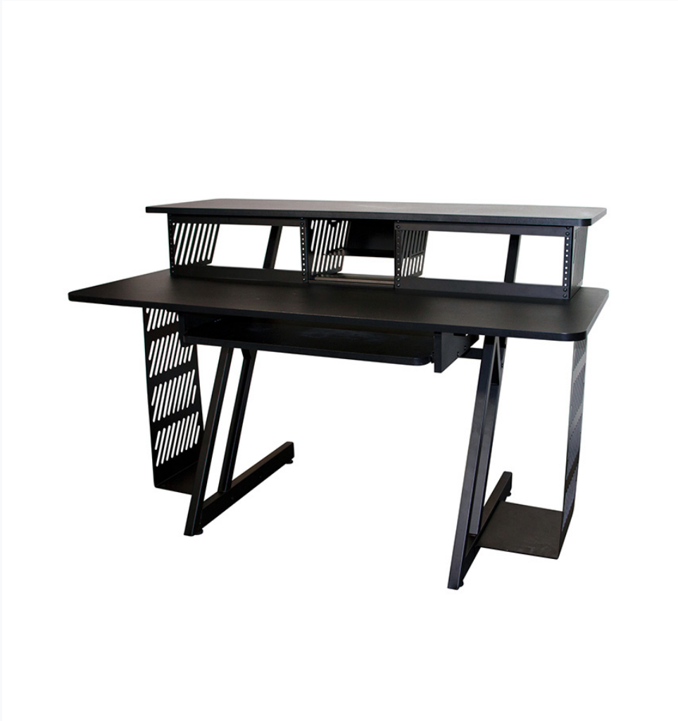
LARGE WORKSTATION WS7700B / 14586