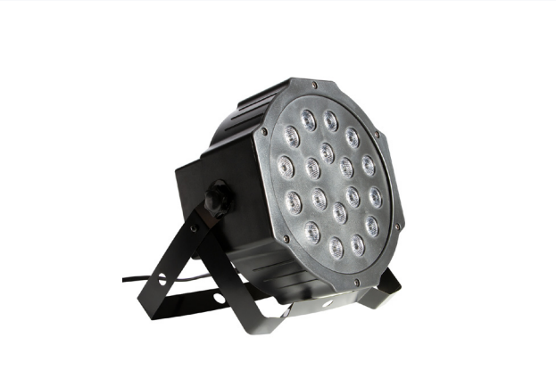
LED WASH LIGHT RGBLED100 / 14027