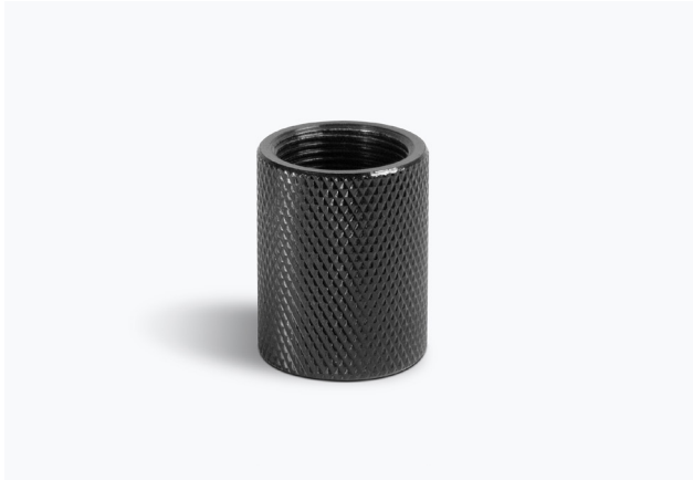
U-MOUNT® FEMALE-TO-FEMALE ADAPTER UM-88 / 10501