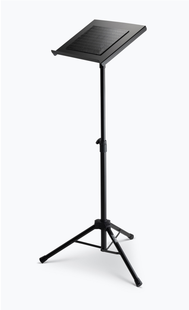
DELUXE LAPTOP STAND LPT7000 / 13430