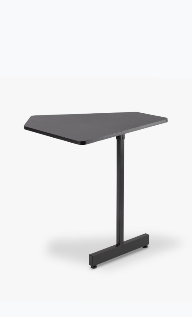
WORKSTATION CORNER ACCESSORY WSC7500B / 12506 / Black WSC7500RB / 12505 / Rosewood