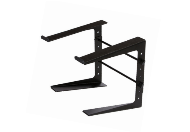
LAPTOP STAND LPT5000 / 11739