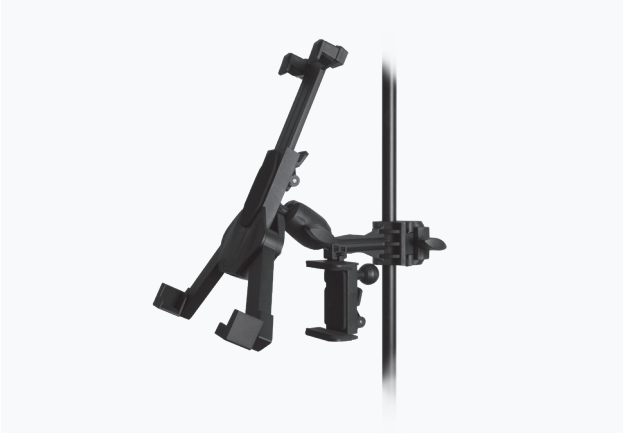
TABLET / SMARTPHONE HOLDER TCM1500 / 13534