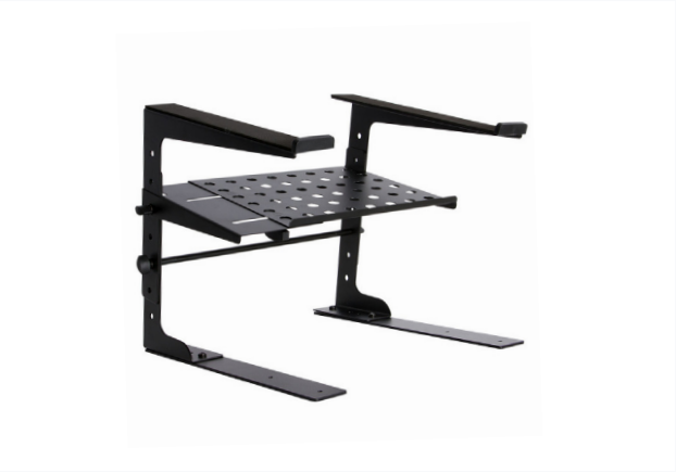
MULTIPURPOSE LAPTOP STAND LPT6000 / 13231