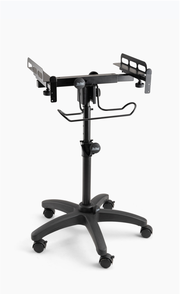
MOBILE EQUIPMENT STAND MIX-400V2 / 14441