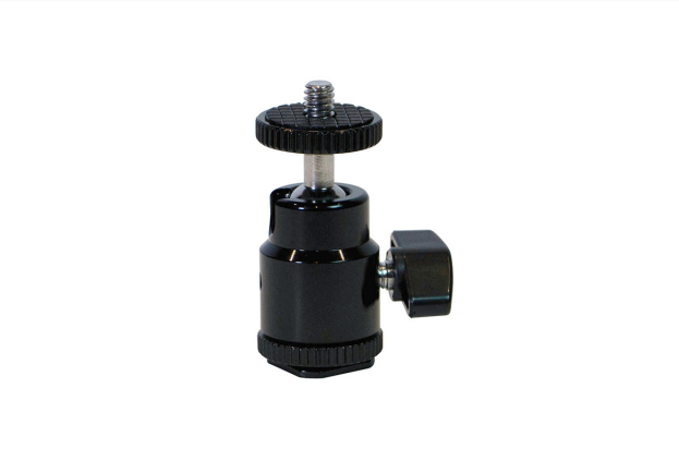
CAMERA ADAPTER WITH SHOE MOUNT CM03 / 14722