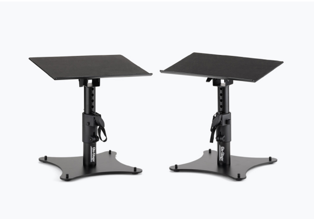
DESKTOP MONITOR STANDS SMS4500-P V2 / 14440