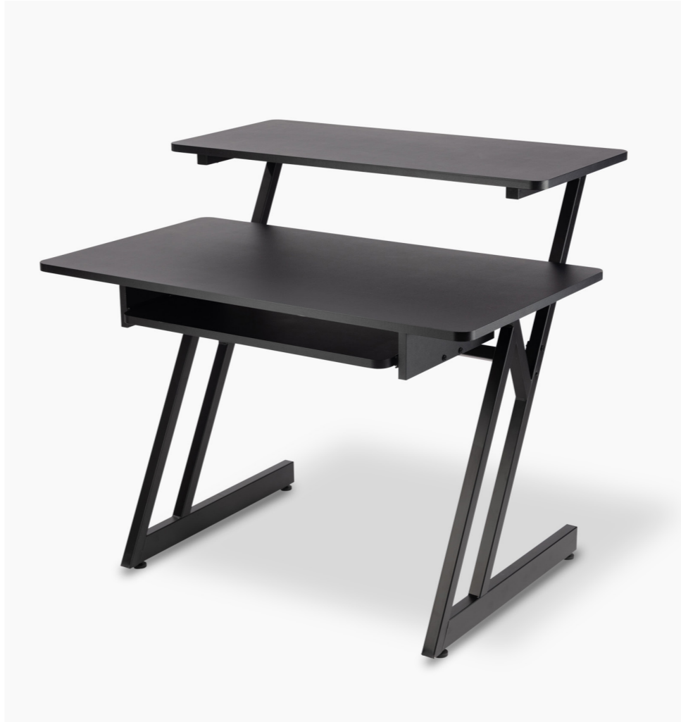
WOOD WORKSTATION WS7500B / Black S7500RB / Rosewood