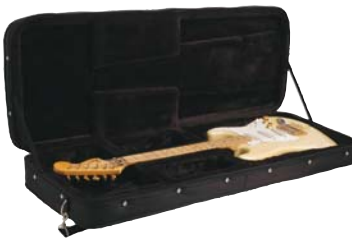
Dimensions for GPCE5550

The plush-lined interior and custom molded case keep your guitar safe and protected.